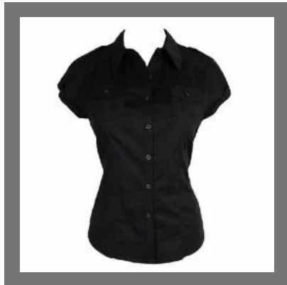
Ladies Casual Tops