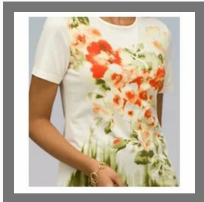
Ladies Printed Tops