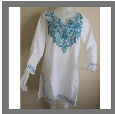
Ladies Embroidered Tops