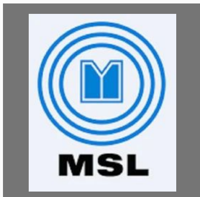
Carbon Steel Seamless Pipe