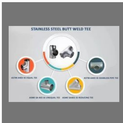
316L Stainless Steel Tee