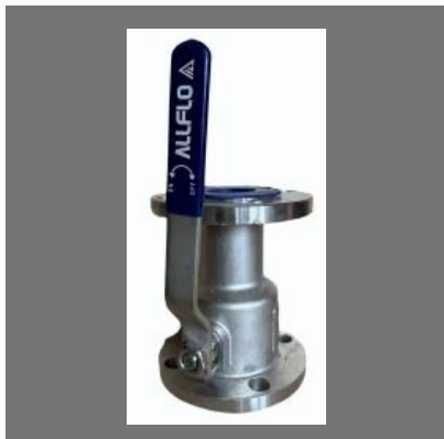
Stainless Steel Ball Valve