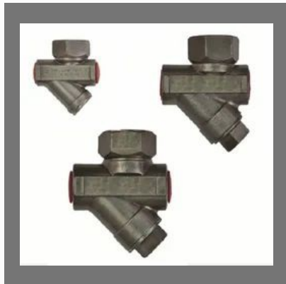
Thermodynamic Steam Trap