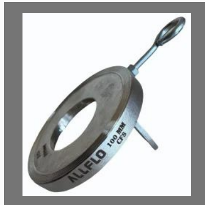
Stainless Steel Wafer Type Check Valve