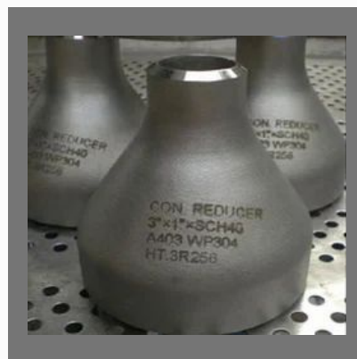
Stainless Steel Concentric Reducer