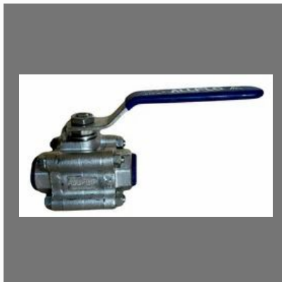
Stainless Steel Ball Valve