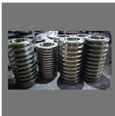
Carbon Steel FCS A105 Flange