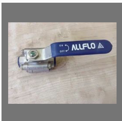
Stainless Steel Threaded End Ball Valve