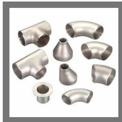
304 Stainless Steel Elbow