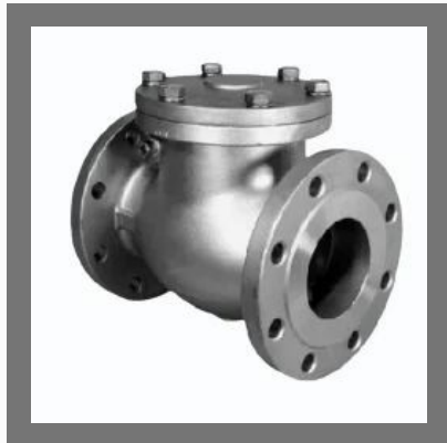
Cast Iron Check Valve