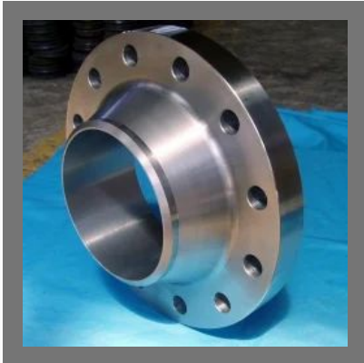
STAINLESS STEEL A182 F304 -316 WNRF FLANGE