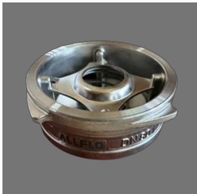
Stainless Steel Disc Check Valve