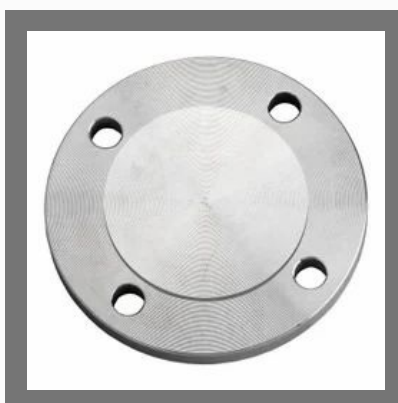
Round Mild Steel Blind Flange