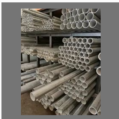
304 Stainless Steel Round Pipe