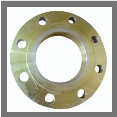
Mild Steel Slip On Flanges