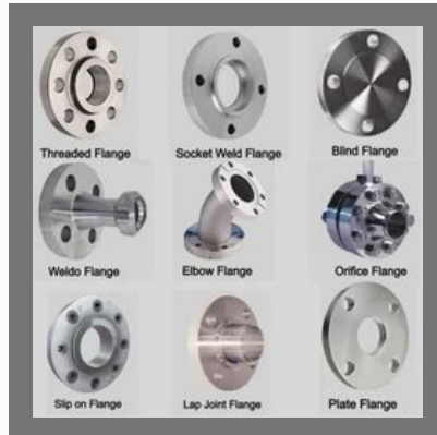
Stainless Steel Slip On Flanges