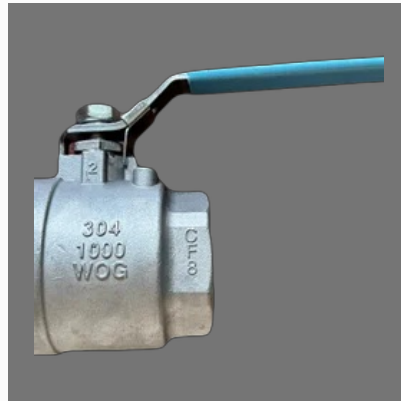
304 Stainless Steel Threaded Ball Valve