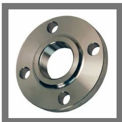
Mild Steel Threaded Flange