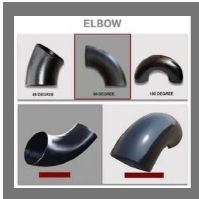
Mild Steel Pipe Elbow