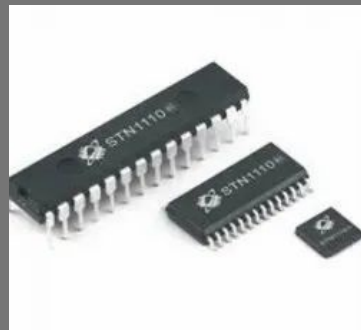
UART Interface IC