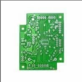
Single Side Printed Circuit Boards