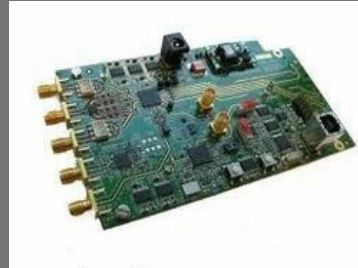
Multilayer Printed Circuit Boards