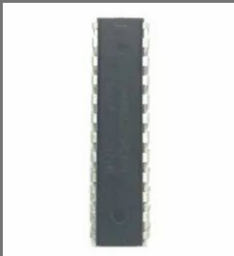
LED Display Driver IC