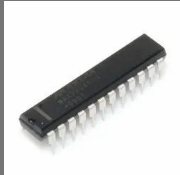
LCD Driver IC