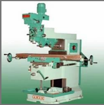
Horizontal Milling Machines