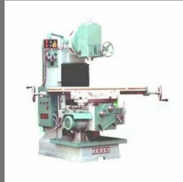
Vertical Milling Machines