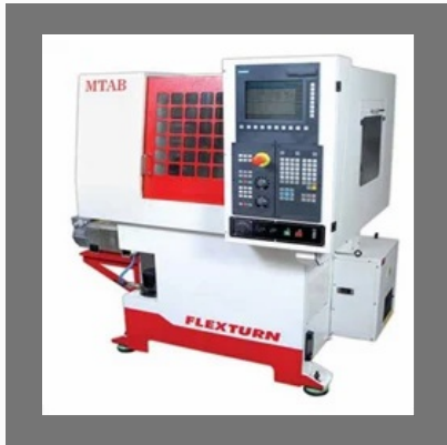
CNC Lathe Machines