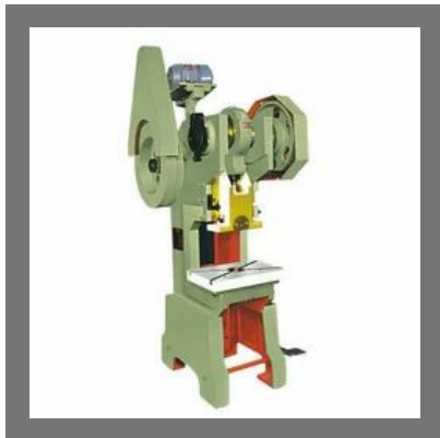
C Type Power Press Machines