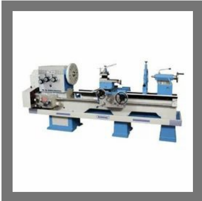
Heavy Duty Lathe Machines