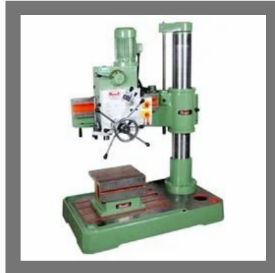
Heavy Radial Drill Machines