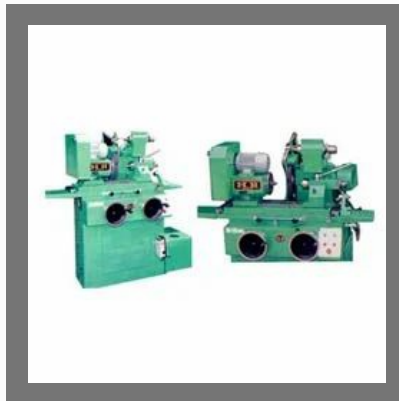
Cylindrical Grinding Machines