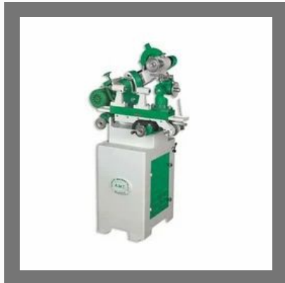
Tool & Cutter Grinding Machines