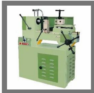
Turret Lathe Machines