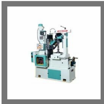
Gear Hobbing Machines