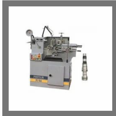
Capstan Lathe Machines