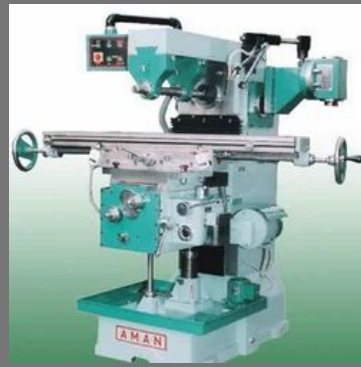
Automatic Milling Machines