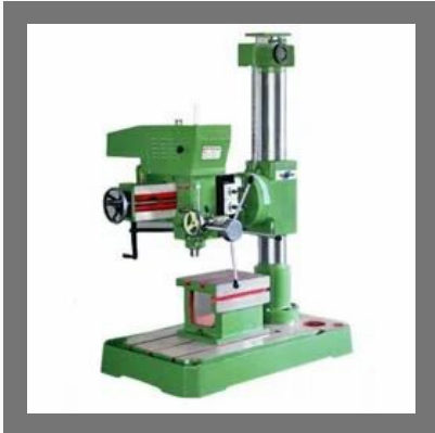
Radial Drilling Machines