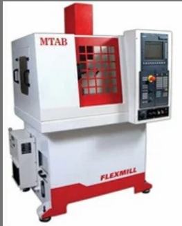
CNC Milling Machines