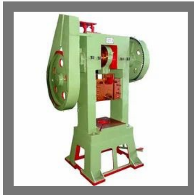
Pillar Type Power Press Machines