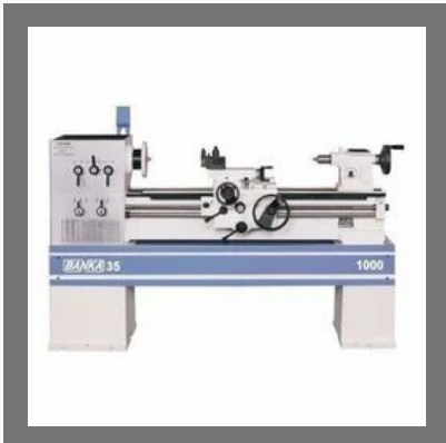
Center Lathe Machines