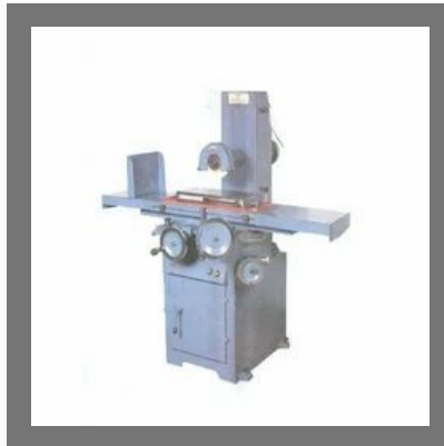
Micro Feed Surface Grinders