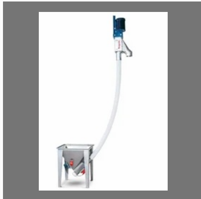
Screw Conveying System