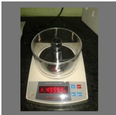
Jewellery Weighing Machine