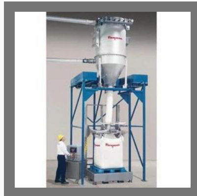
Pneumatic Conveying System