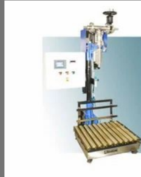
Drum Filling System