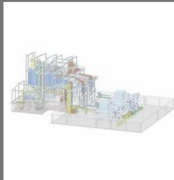
Glass Plant Batching System