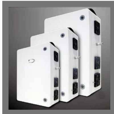
Hydrogen UPS Power System