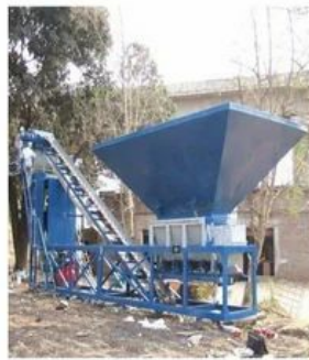
Concrete Batching System