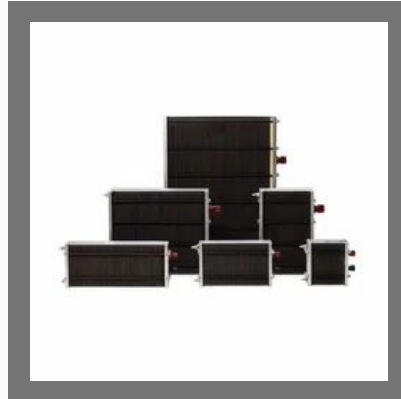
Hydrogen PEM Fuel Cells