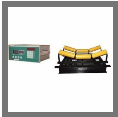
Belt Weighing System