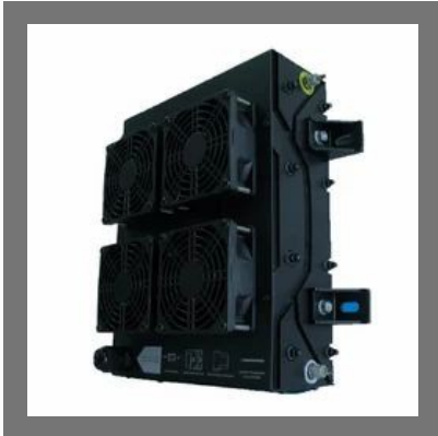
Hydrogen Car Fuel Cell