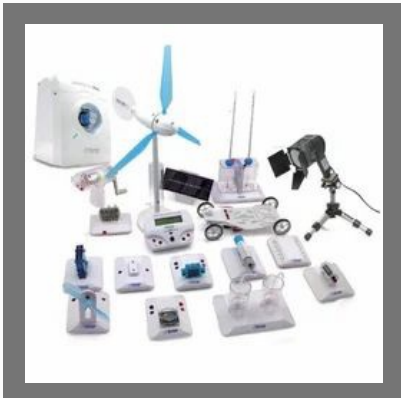
Clean Energy Science Kits