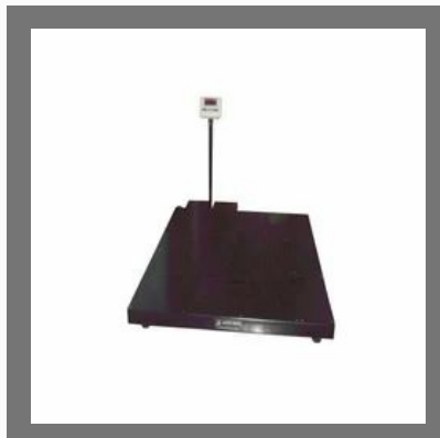
Low Profile Platform Scale