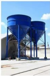
Tank Weighing System