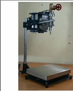
Can Filling System