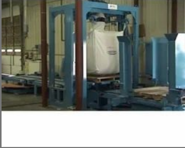
Jumbo Bagging System