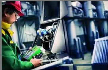
Instrumentation Design with IN-Tools & Automation