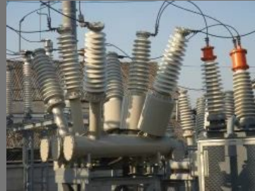
Electrical Design & Detail Engineering Course