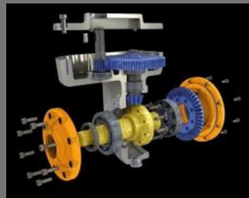
Autocad 2D & 3D with Autodesk Inventor