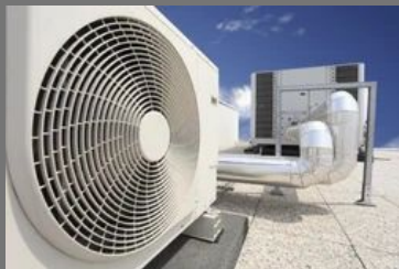
HVAC Design Course