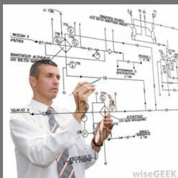
Process Engineering Course