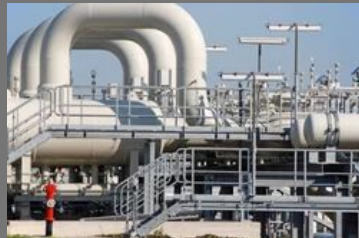
Piping Design Engineering Course