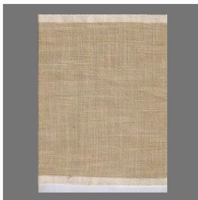
Designer Upholstery Fabrics