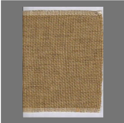
Jute Upholstery Fabric