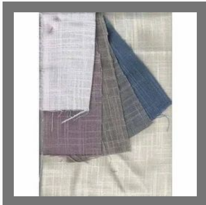
Bold Curtain Fabrics