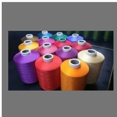
Dyed Polyester Yarn