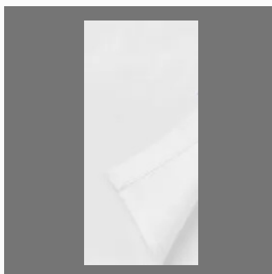
Anti Virus /Anti Bacteria Treated 100 Percent Cotton Bedsheets and Pillow Covers