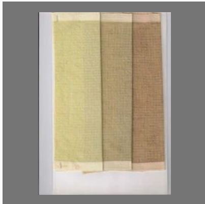
Designer Curtain Fabrics