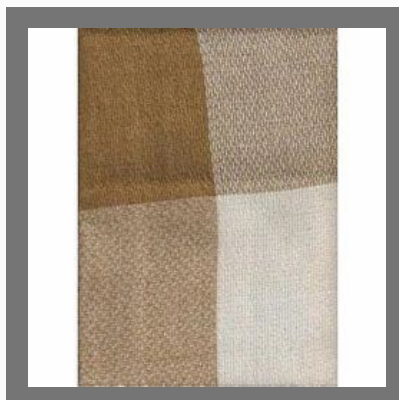
Fancy Upholstery Fabrics