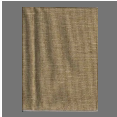
Vinyl Upholstery Fabric