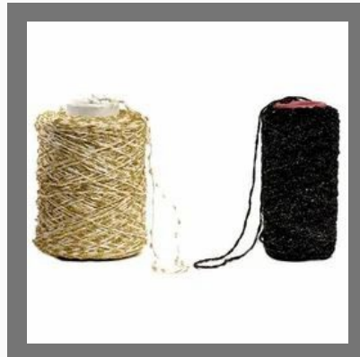
Chenille Fancy Yarns