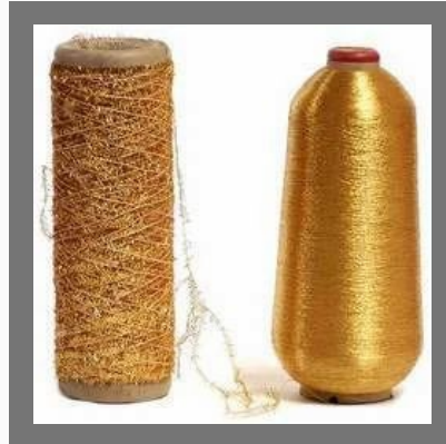
Specialty Fancy Yarns