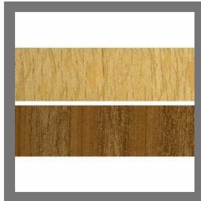
Table Runner Fabrics