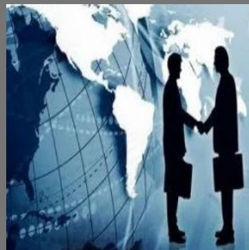
Corporate Advisory Services