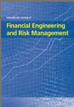
Financial Engineering & Risk Management