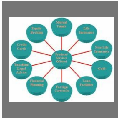
Wealth Management Services