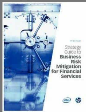
Financial & Business Strategies Services