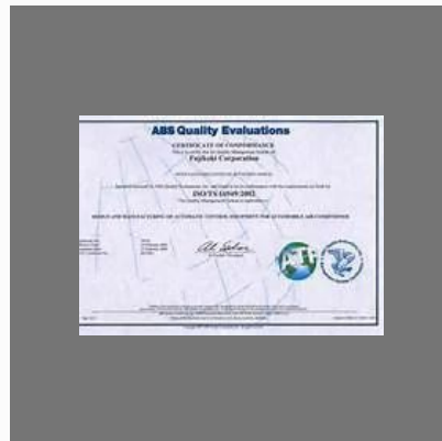
QS 9000/TS 16949 Quality system Standards for Automotive Ind