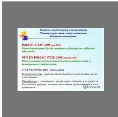
ISO/IEC 17025:2005 General Requirement for the Competence