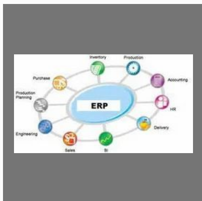
Erp, Website Development And Corporate Presentation Software