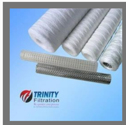
PP Cartridge Filter