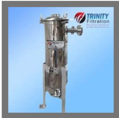
Bag Filter Housings