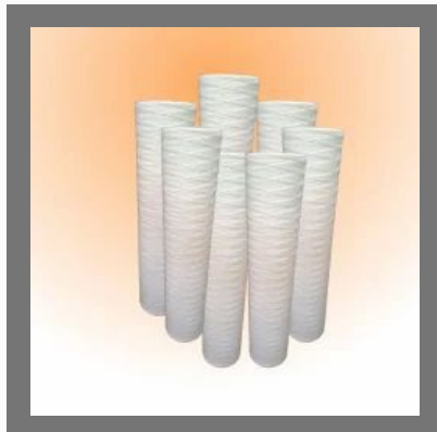
String Wound Filter Cartridge