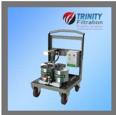
Oil Filtration System