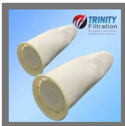
Dual Flow Bag Filter