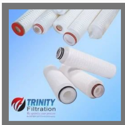
Hydrophobic Air Bacterial Filter