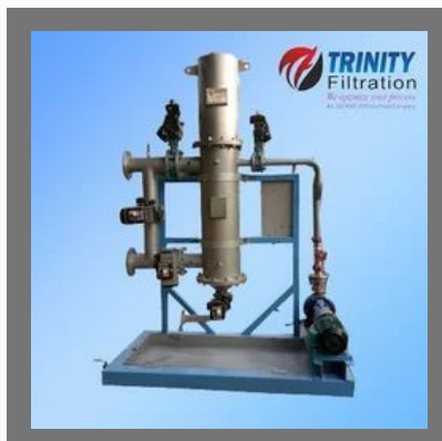
Self Cleaning Magnetic Separator