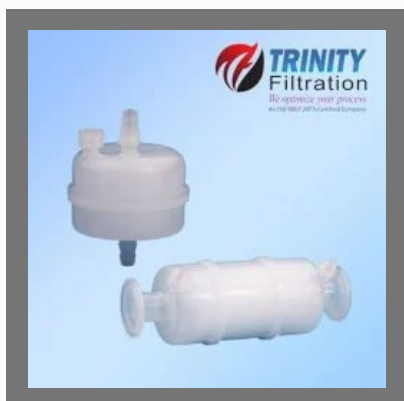
Steri- PRO Capsule Filters