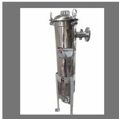
Stainless Steel Bag Filter Housings