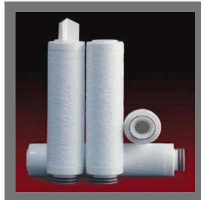
Spun Bonded Filter Cartridge