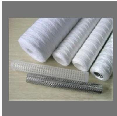
Water Filter Cartridge