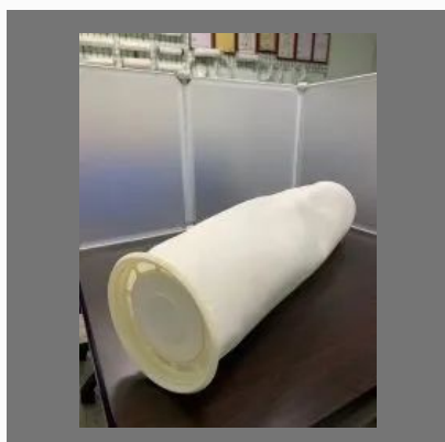
Dual Flow Bag Filters