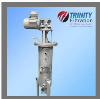
Self Cleaning Filter Systems