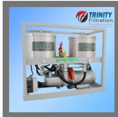
Hydraulic Oil Filtration Systems