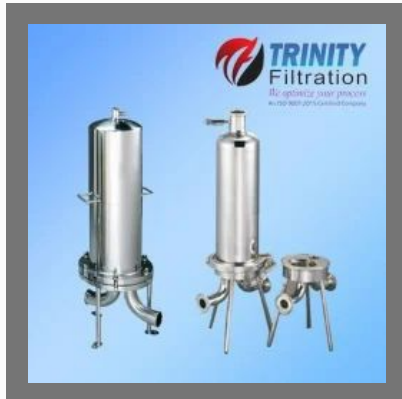
Sanitary Filter Housings