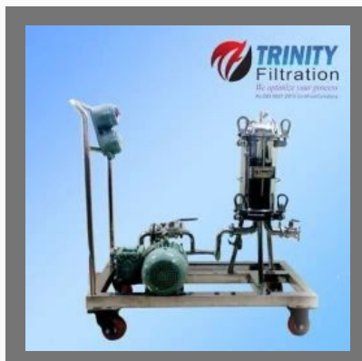
Oil Purification Systems