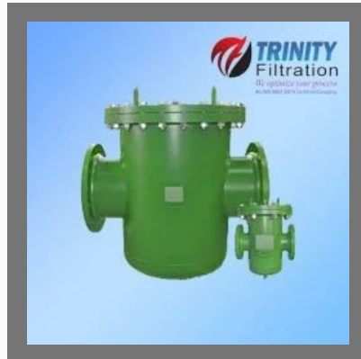
SS Basket Strainers