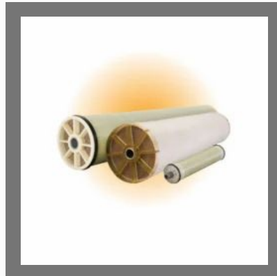
Ultrafiltration Membranes for Automotive E-Coat