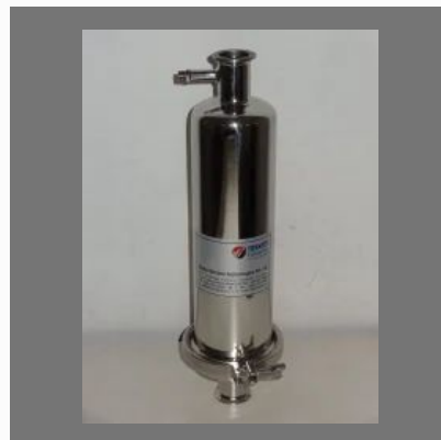
Tank Vent Filter