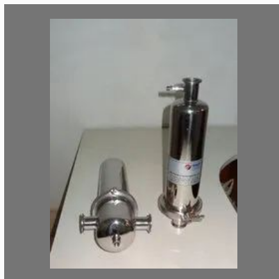
Tank Vent Filter