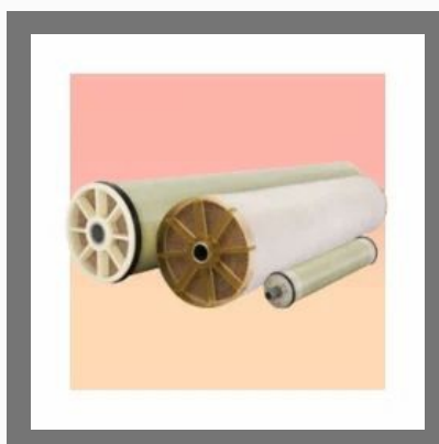
Ultrafiltration Membrane Systems