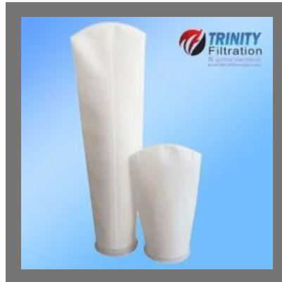
PP Filter Bag