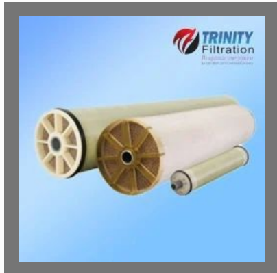
FAST Automotive Ultra Filtration Membrane