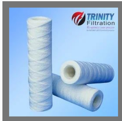
Pp Wound Filter Cartridges