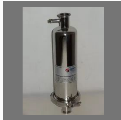
Sanitary Vent Filter