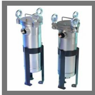
Cartridge Filter Housing