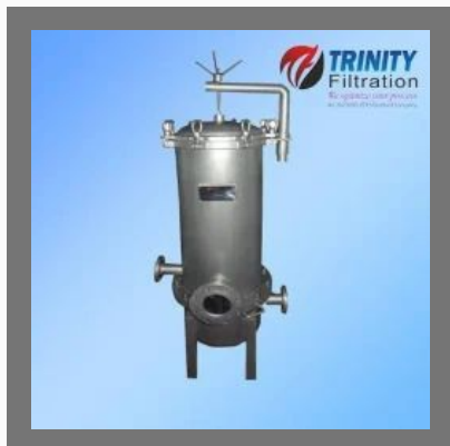
Industrial Filter Housings