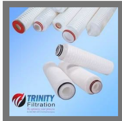
PES Sterilizing Grade Filters