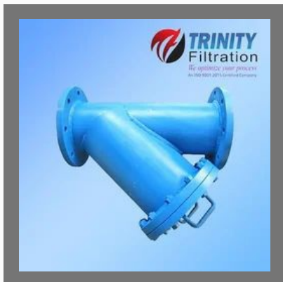
Fabricated Y Type Strainer