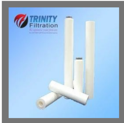
Pure GUARD Bi-Component Fibre Filter Cartridges