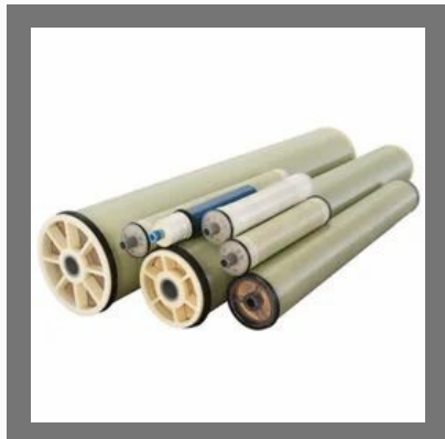
Automotive E Coat Ultra Filtration Membranes