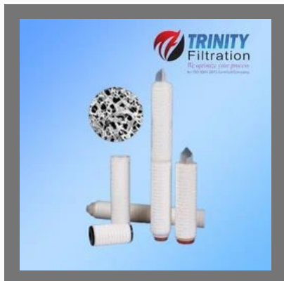
Steri PRO PV series PVDF Filters