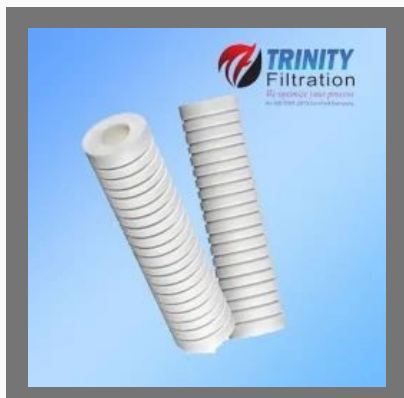
Micron Cartridge Filter