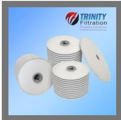
Lenticular Filter Housing