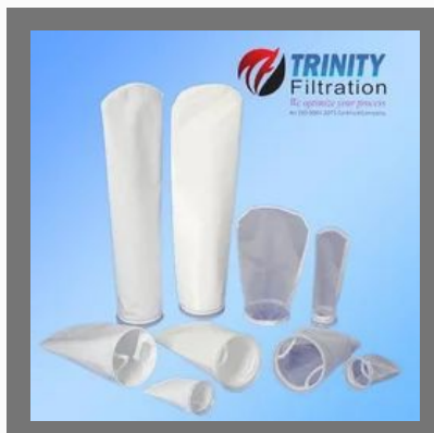
Oil Absorbent Bag Filters