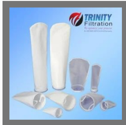
Oil Bag Filters