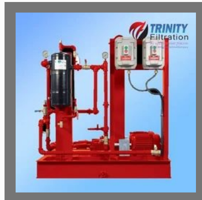
Skid Mounted Filtration Systems