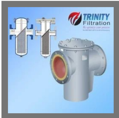
Fabricated Basket Strainers