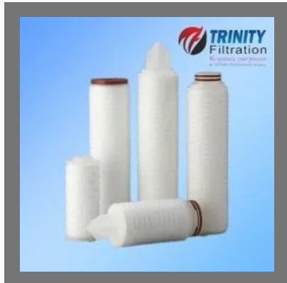
PTFE Membrane Filters Cartridges