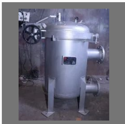
Stainless Steel Bag Filter Housings