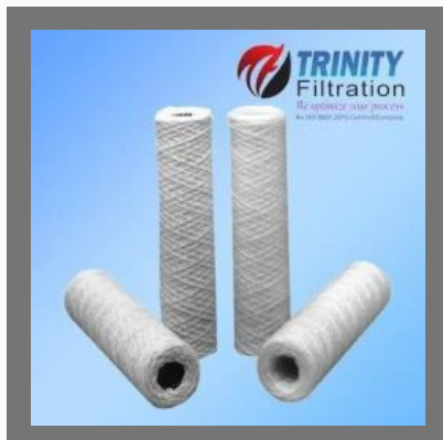
PP Blanket Media Filter Cartridge