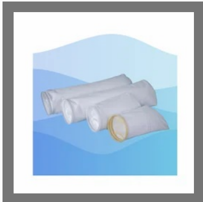
Liquid Filter Bags