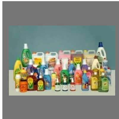
Multipurpose Household Liquid Cleaners