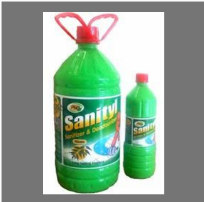
Pine Oil Sanitizers