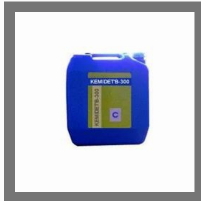
Industrial Detergent Cum Wetting Agent