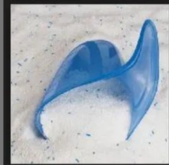
Enzymatic Detergent Powder