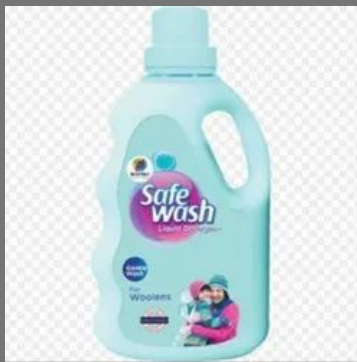
Laundry Liquid Detergents