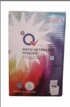
Laundry Detergent Powders