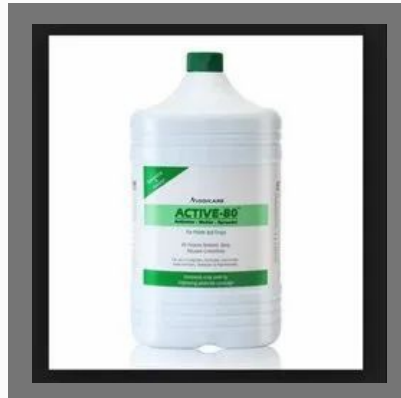
Horticultural Spray Adjuvants