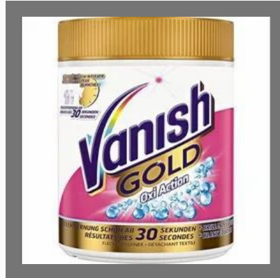
Fabric Stain Removers