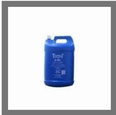
Hard Surface Cleaners