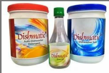
Automatic Dish Washer Detergents