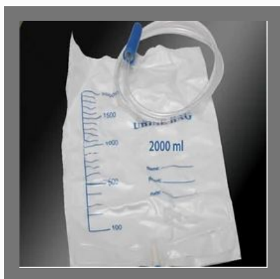
Urine Collector Bags (200 ML)