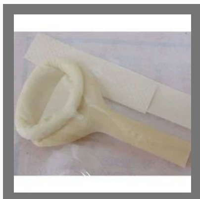
Male External Catheter