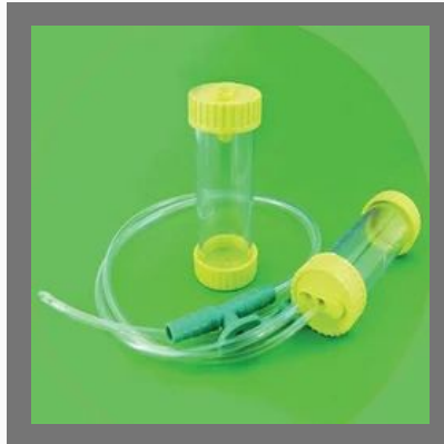
Infant Mucus Extractor