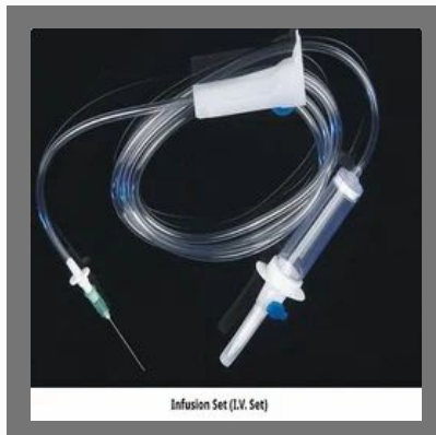
Surgical Infusion Set (Flow Regulator)