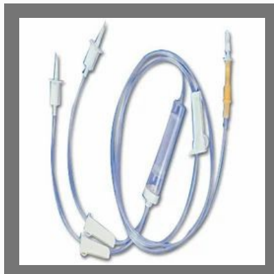
Blood Transfusion Set