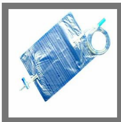
Disposable Urine Bags