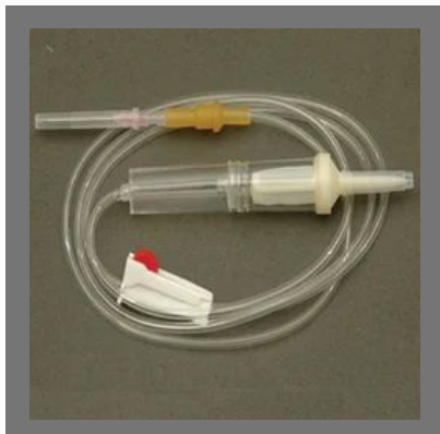
Surgical BT Set