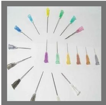
Disposable Surgical Needles