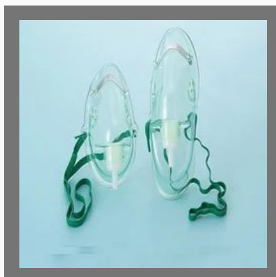
Medical Oxygen Masks