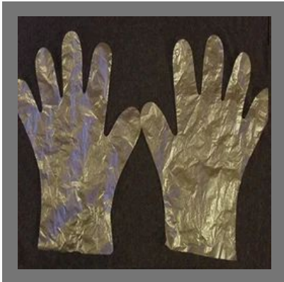
Examination Plastic Gloves