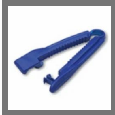
Umbilical Cord Clamps