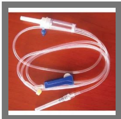
Micro Drip Infusion Set