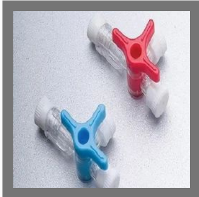
3 Way Stopcock