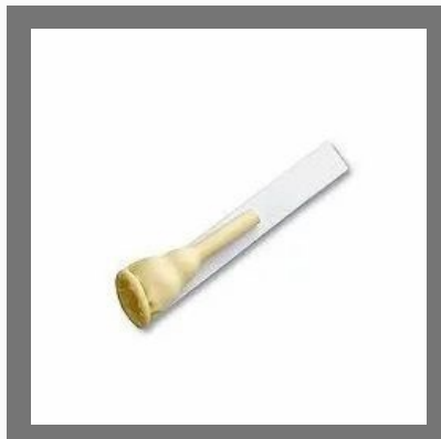
Urinary Male Catheters