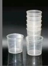
Caps and lids