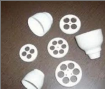
Electric Fitting Equipment