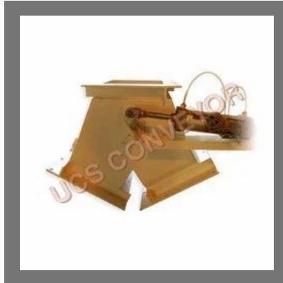
Pneumatic Diverting Gate