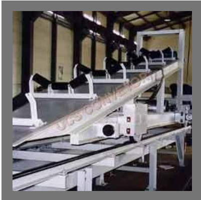
Traveling Tripper Conveyors