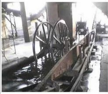
Submerged Belt Conveyors