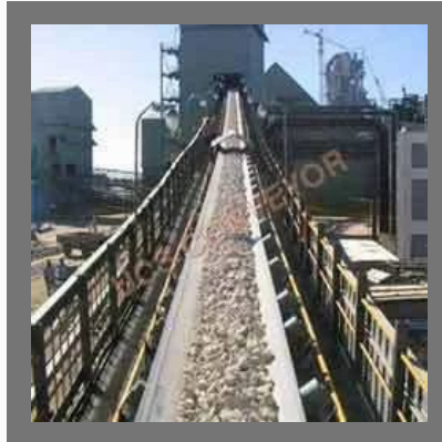
Belt Conveyor Systems