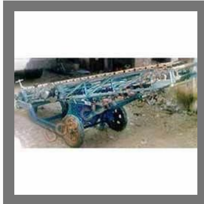
Portable Bag Stackers