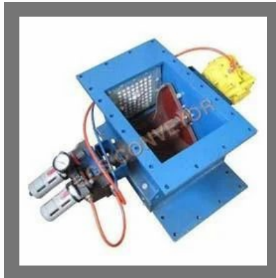
Pneumatic Flow Control Gate