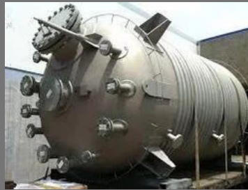
Industrial Pressure Vessels