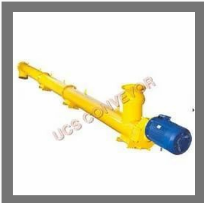
Pipe Screw Feeder