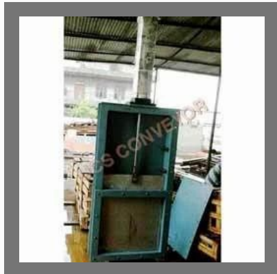
Pneumatic Slide Gate