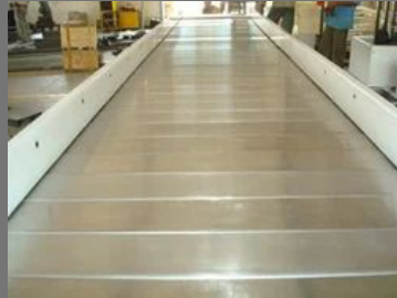
Slat Chain Conveyors