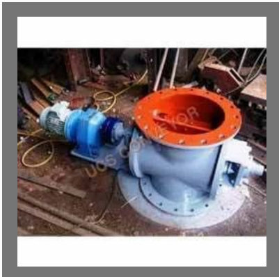
Rotary Air Lock