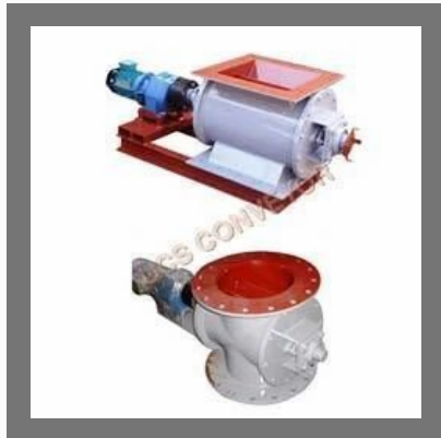
Rotary Airlock Valve