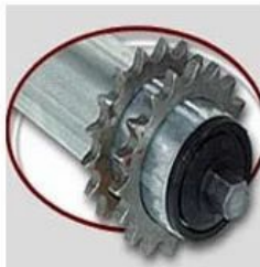
Chain Sprocket Rollers