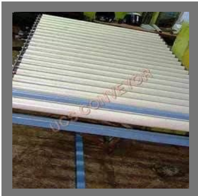
Gravity Roller Conveyors