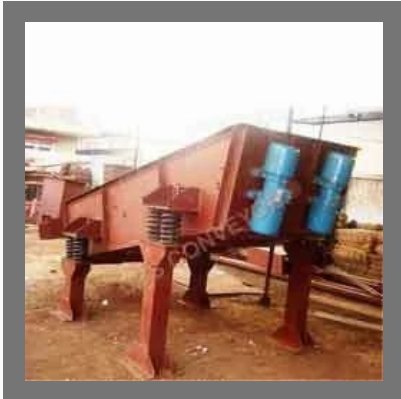
Motorized Vibratory Screen