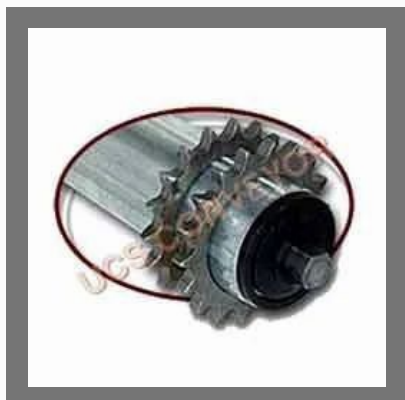
Roller Chain Sprocket