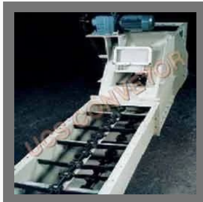
Drag Chain Conveyors