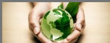
Environmental Due Diligence - Phase - III