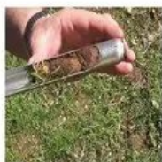
Soil Testing Laboratory