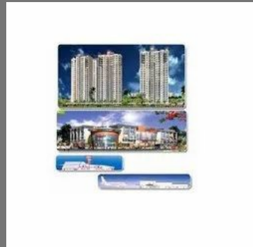
Environment Monitoring Consultancy Service