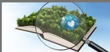
Environmental Due Diligence - Phase - II