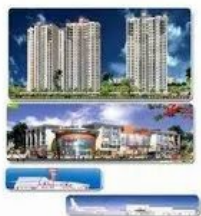
Environmental Monitoring Service