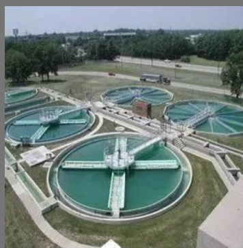
Effluent Water Treatment Plant