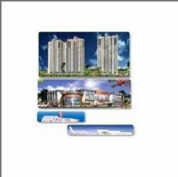
Environmental Impact Assessment Service