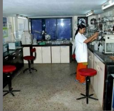
Environmental Laboratory Services