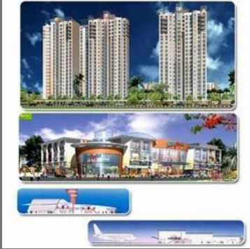
Environmental Consultancy Services