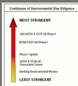
Environmental Due Diligence - Phase - I