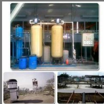
Project Consultancy & Turnkey Project