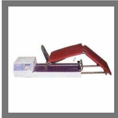
Continuous Passive Motion