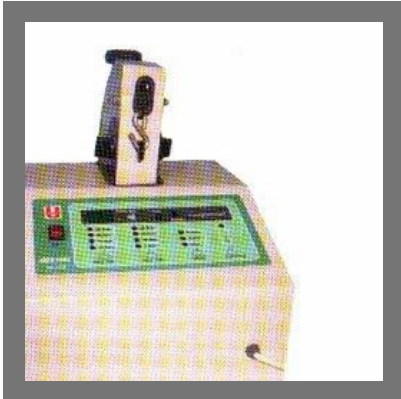
Unique Cervical Cum Lumbar Traction