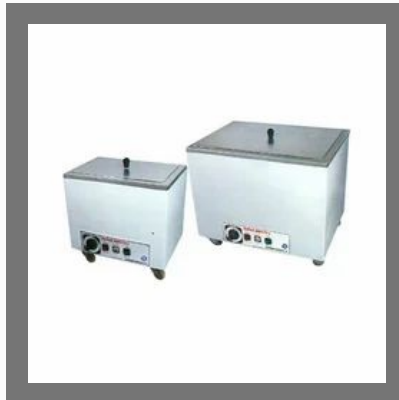
Paraffin Wax Bath