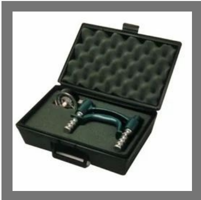
Hydraulic Hand Dynamometer