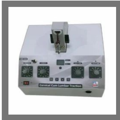
Lumbar Traction Machine