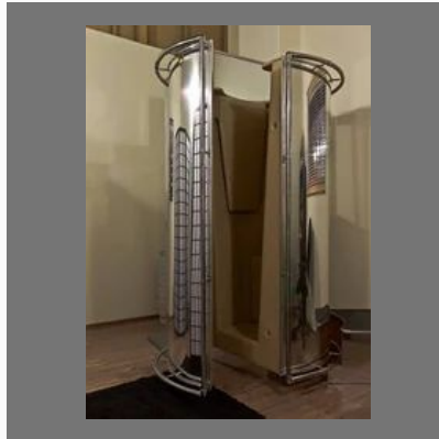
Cryo Therapy Unit