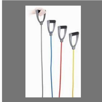
Latex Pull Exerciser