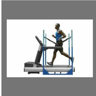
Treadmill With Unweighing Systems