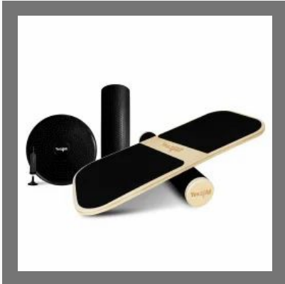
Multi-Function Balanced Board