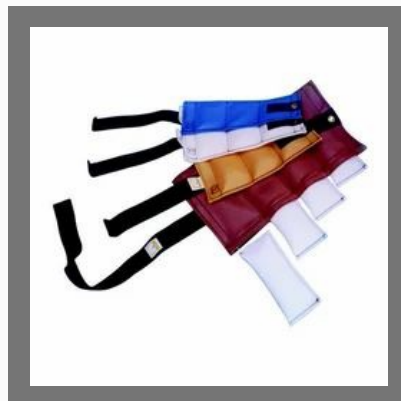
Weight Cuff Set