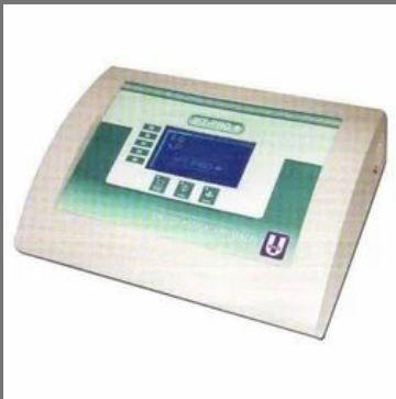
IFT Pro Plus