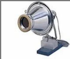
Infra Red Lamp