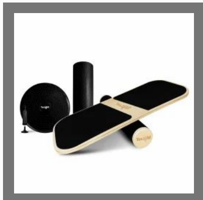
Multi-Function Balance Board