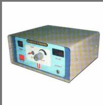
Ultrasound Therapy Unit