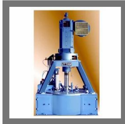
Uttam G-1750 Batch Centrifugal Machine