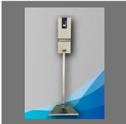
Ss304 Uttam's Hand Sanitizer Dispenser