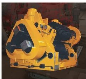
Uttam 5 Mills Low Energy High Efficiency Milling