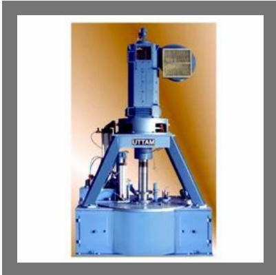
Uttam G-750 Batch Centrifugal Machine