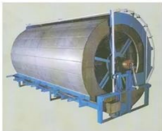
Uttam 10.1 M.T. Cane MUD Filtration System