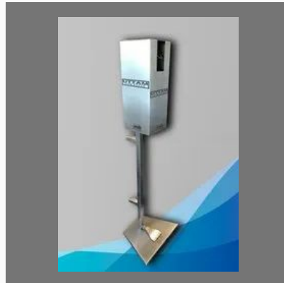
Ss304 Uttam's Hand Sanitizer Dispenser, Hinged Concealed