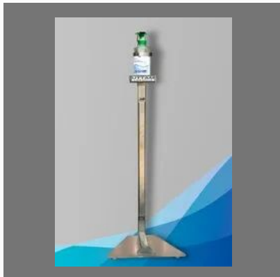
Ss304 Uttam's Hand Sanitizer Dispenser, Easy Refill Type, Capacity: 200ml - 2 Litres