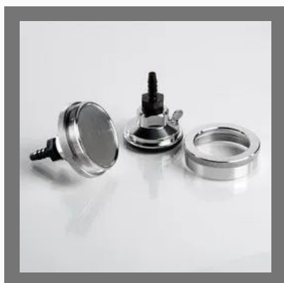
In Line Filter Holders 47mm