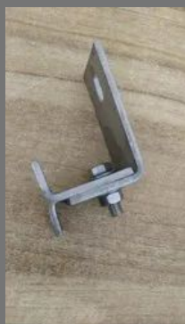
Stainless Steel Stone Cladding Clamp