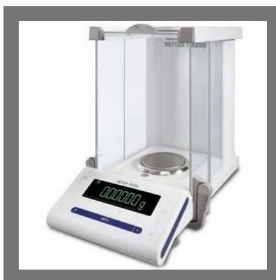
Semi Micro Balance