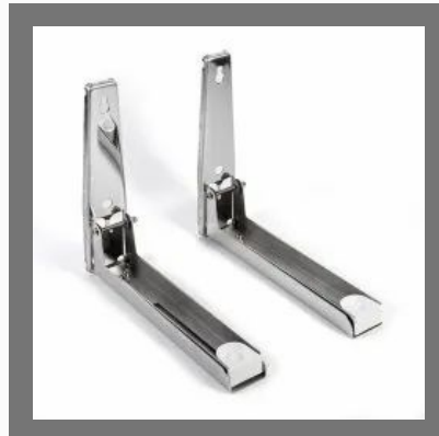
Microwave Oven Bracket