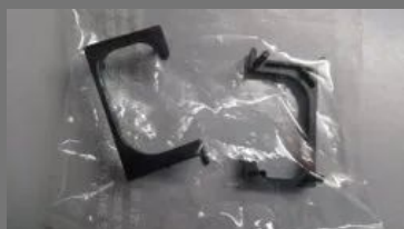
G Section End Cap