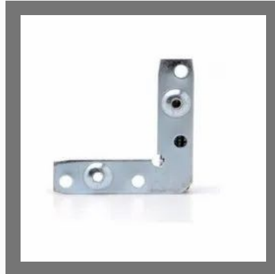
Profile Connectors SS