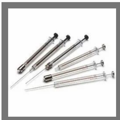
Hamilton Gas Syringes