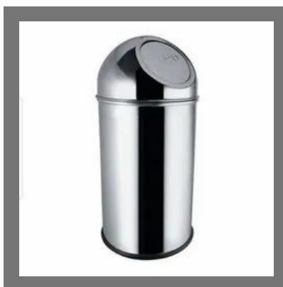
SS Push Bin