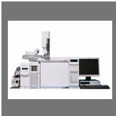
Gas Chromatograph System with FID Detector