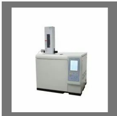
Gas Chromatograph System with FID TCD Detector