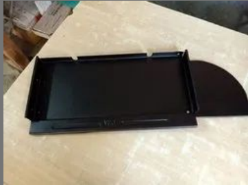
metal keyboard & mouse tray