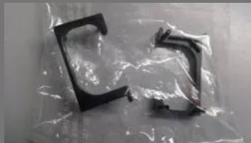
G Section End Cap