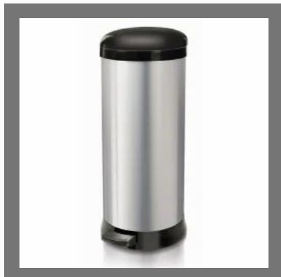
SS Pedal Bin Plain