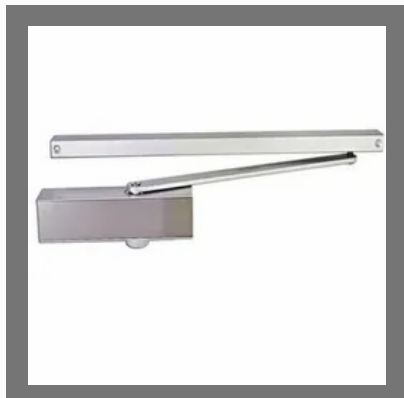
Pelmet ARM Door Closer