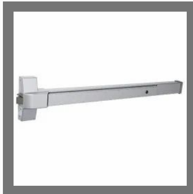
Panic Exit Device