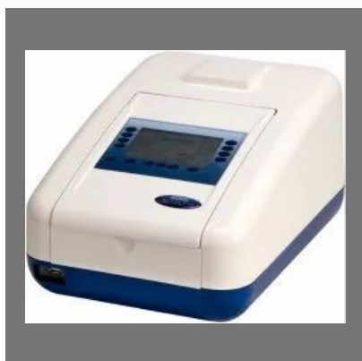
Spectrophotometer Czerny- Turner Mounting