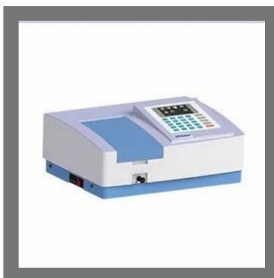
Double Beam Spectrophotometer UV1900