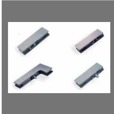
Bottom Patch Lock