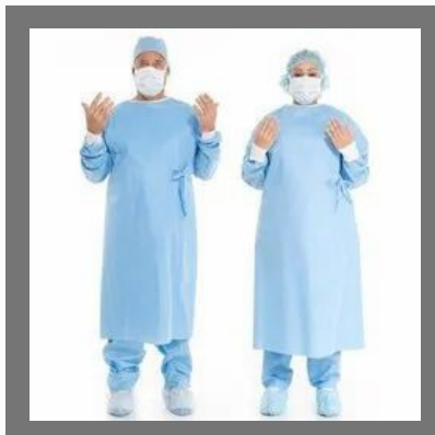
PPE KIT Surgeon Gown- 90 GSM Fabric-A