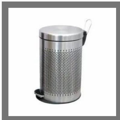
SS Pedal Bin Perforated