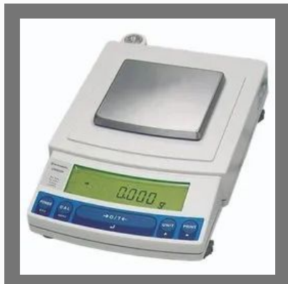
Top Pan Balance