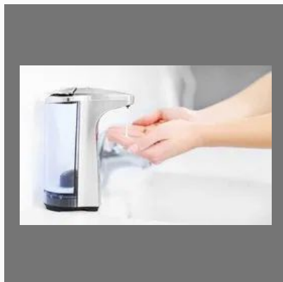
Automatic Soap Dispensers