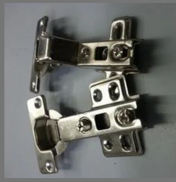
Auto Closing Hinges