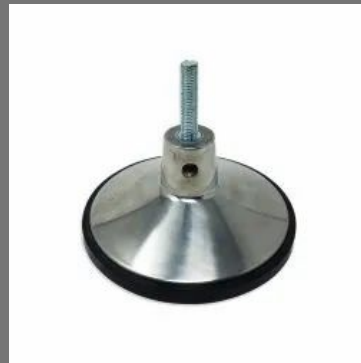
Leveler with Insert