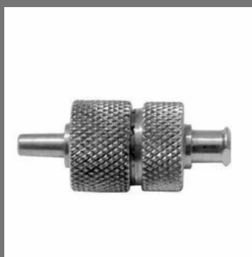
SS Syringe Filter Holder