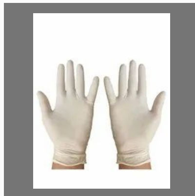
Latex Hand Gloves