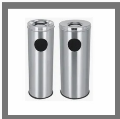
SS Swing Bin