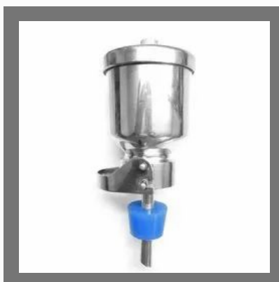
SS Membrane Filter Holder