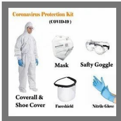
PPE KIT Hoop Cap