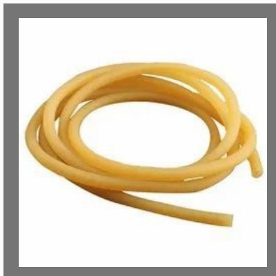
Latex Surgical Rubber Tubings