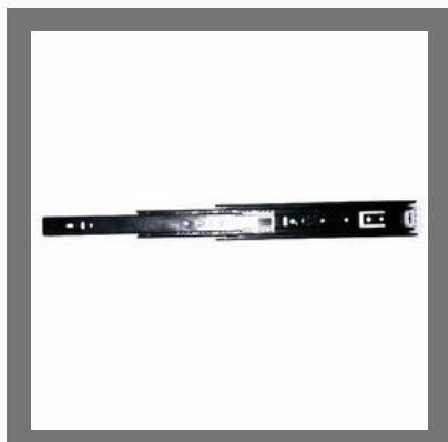
Telescopic Channel Medium Extra Heavy