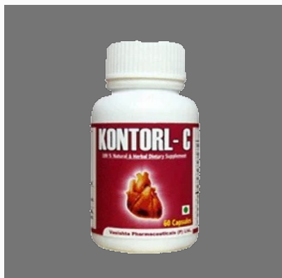
Kontrol C (Herbal Supplement Capsules)