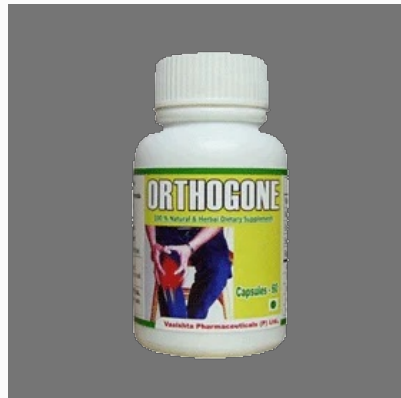
Orthogone (Herbal Supplement Capsules)