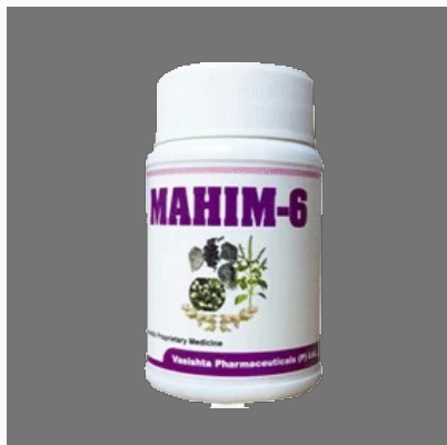
Mahim6 (anti Asthmatic Capsules)