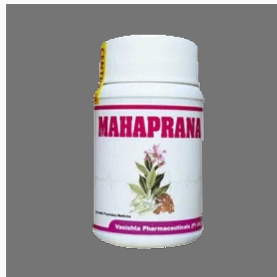
Mahabala (energy Booster Capsules)