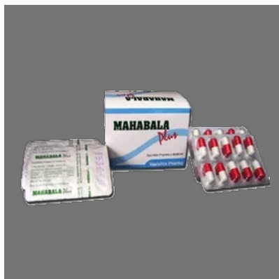
Mardana (musculoskeletal Pain Relief Capsules)