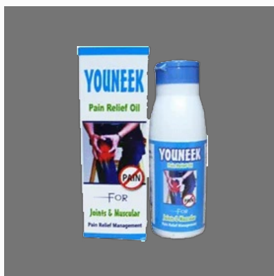
Pain Relief Oil