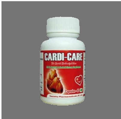
Cardicare (herbal Supplement Capsules)