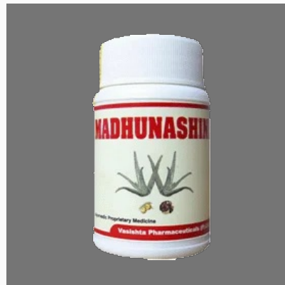
Madhunashini (Anti Diabetic Capsules)