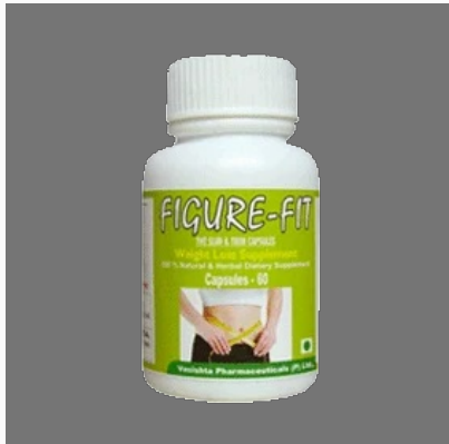
Slimnarc (Herbal Supplement Capsuels)