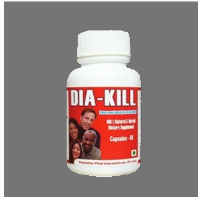
Diakill (Herbal Supplement Capsules)