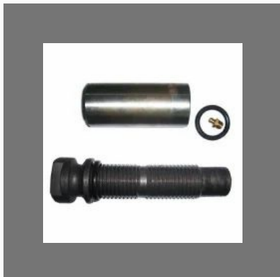
Scania Springs Pin 36 X 180 MM