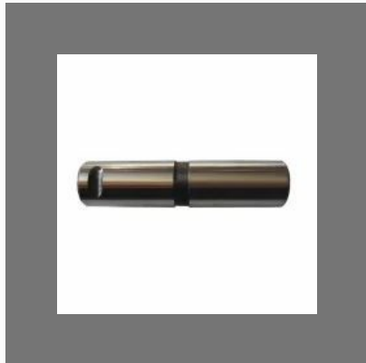
Nissan Spring Pin 54215-Z2001