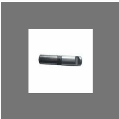
Hino Spring Pin 48423-1790