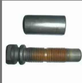
Scania Springs Pin 35 X 168 MM