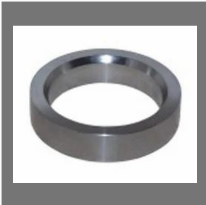
Mercedes Thrust Cone