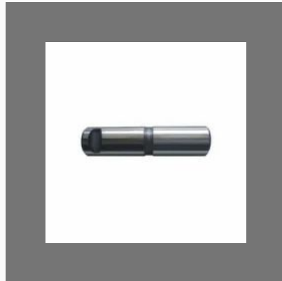
Nissan Spring Pin 54215-Z5009