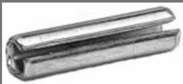
2214/2516 Taurus Spring Pins