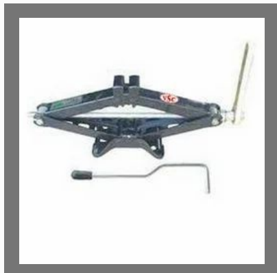
Jacks And Hand Tools