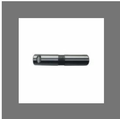
Nissan Spring Pin 54215-00Z00