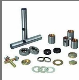
Eicher Galaxy Spring Pins