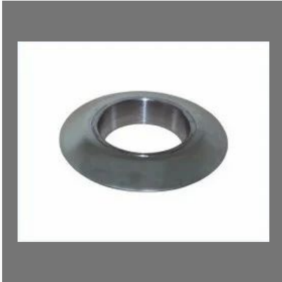
Thrust Cone-14 Ton BPW