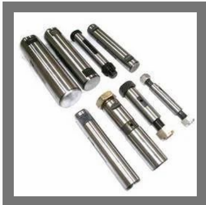
Spring Pins & Bell Crank Pins