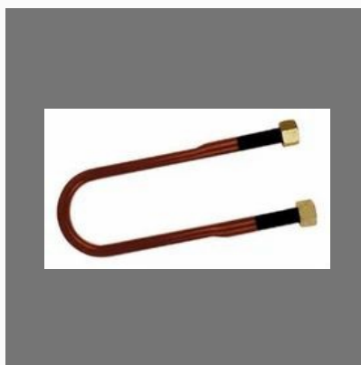
Center Bolt Volvo M14