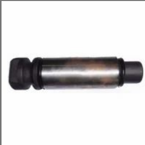
Scania Springs Pin 46 X 102 MM