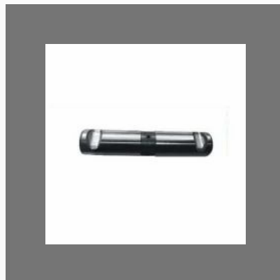
Hino Spring Pin 48423-1810