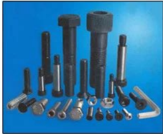
Hi Tensile Bolts