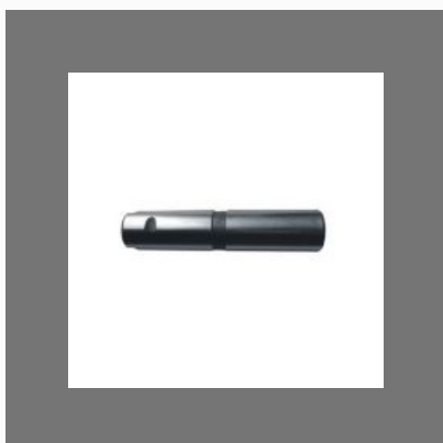
Nissan Spring Pin 55224- Z0000