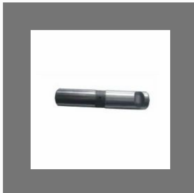
Hino Spring Pin 48423- 2270/1790