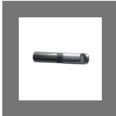
Hino Spring Pin 48423-1370