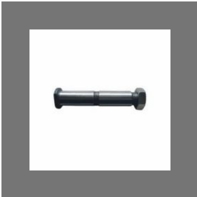
Hino Spring Pin 48432-1170