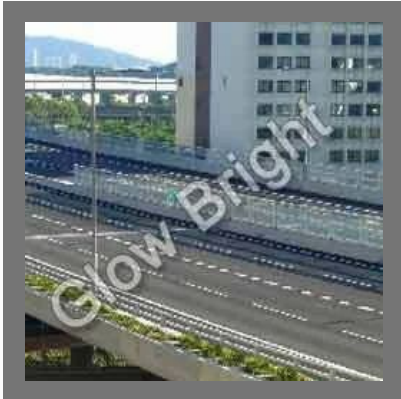
Polycarbonate Acoustic Barriers