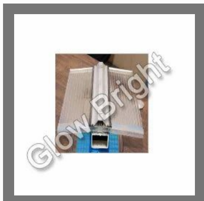
MS Structural Fabrication Services