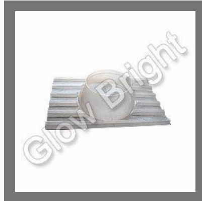
Polycarbonate Acoustic Plate