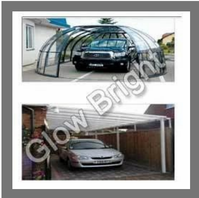
Car Porsches And Canopies