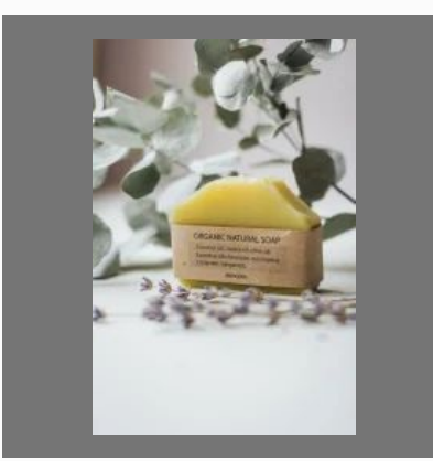
Organic Handmade Soap