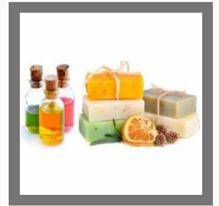
Toilet Soaps Fragrance