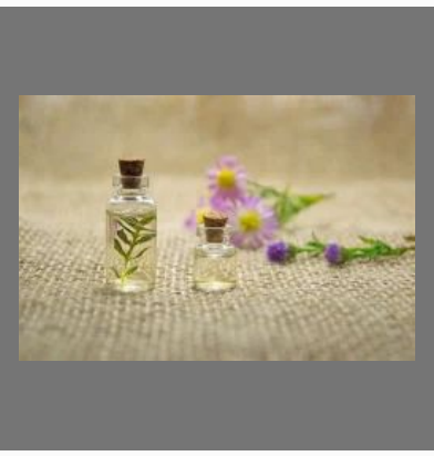
Aromatic Essential Oil