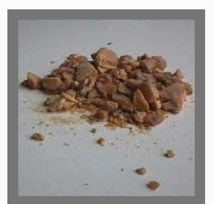
100ml Peru Resinoid