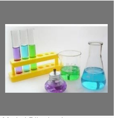
Methyl Dihydro Jasmonate