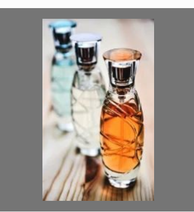
Liquid Air Freshener