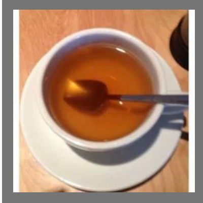
Ginger Arte Super 807