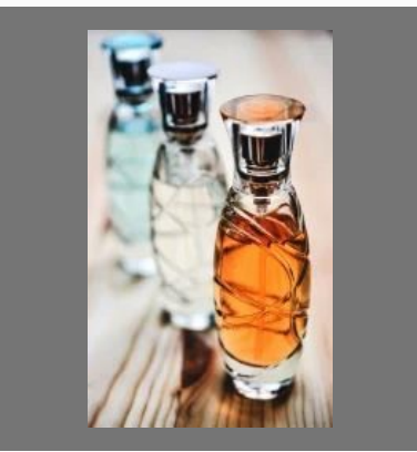
Air Freshener Refills