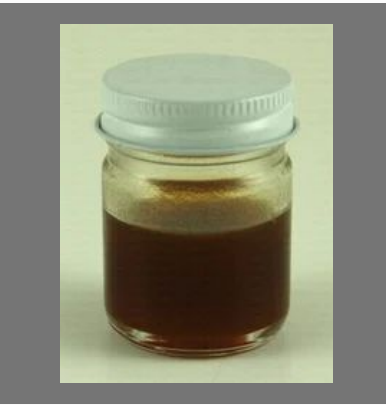
Oakmoss Resinoid Oil