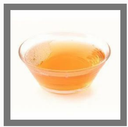
Styrax Resinoid Chemical