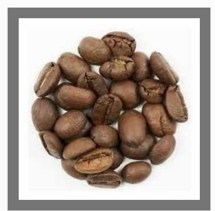
Coffee Aroma Oil