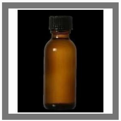
Resinoid Oakmoss Aromatic Chemical