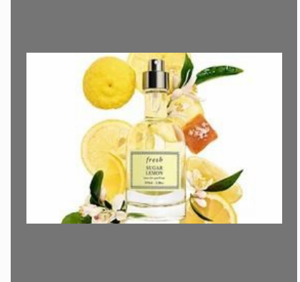
Lemon Dish Wash Fragrance