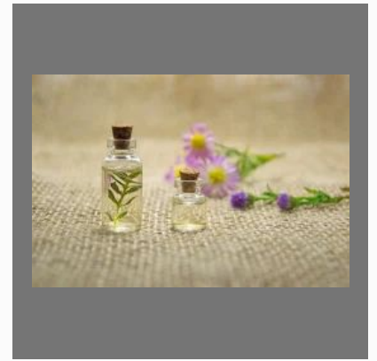
Aroma Diffuser Oils