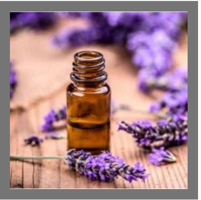
Lavender Fragrance Oil