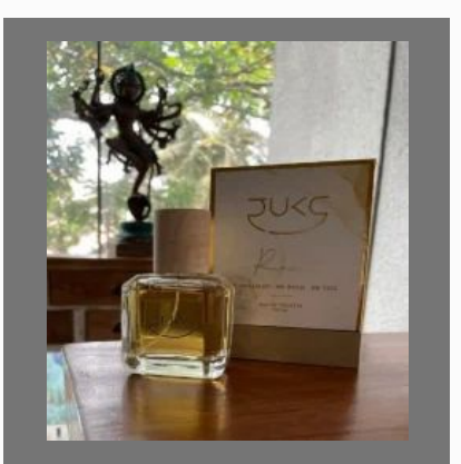
Body Spray Fragrance Oil