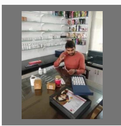
Fragrance Gift Set