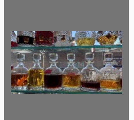
Room Perfumery Products