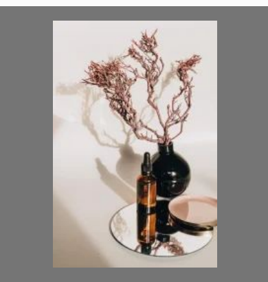
Organic Essential Oils