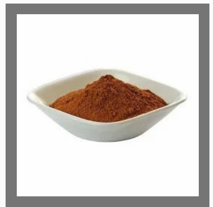
Dark Cocoa Extract