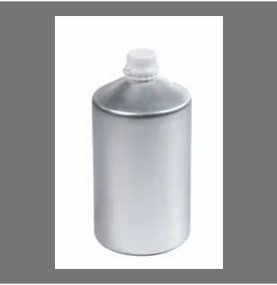
Natural And Synthetic Resinoid