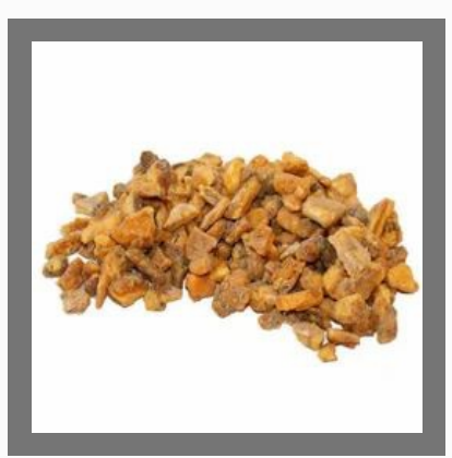
Gum Benzoin Loban