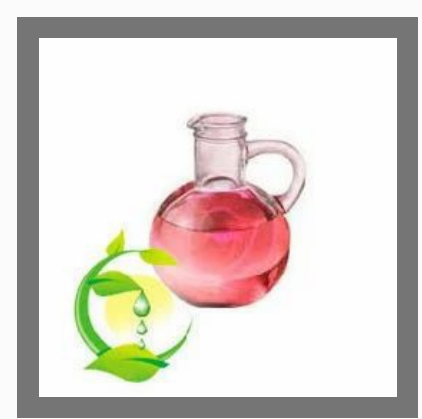
Gurjan Balsam Dark Oil