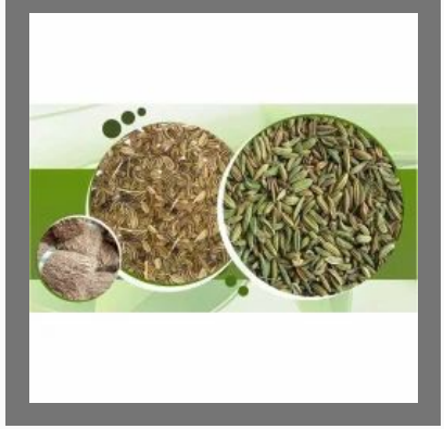
Propenyl Guaethol (Vanitrope)