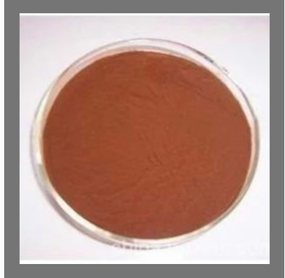
Black Tea Extract Powder 740