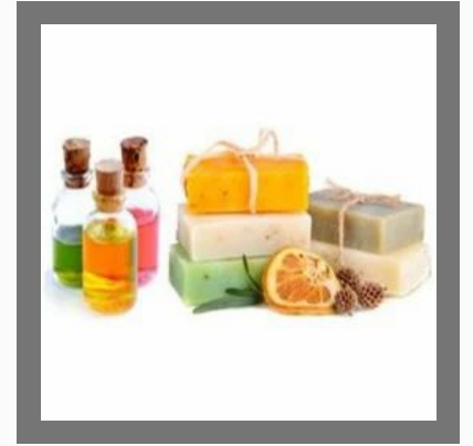
Fragrances For Soaps Detergents