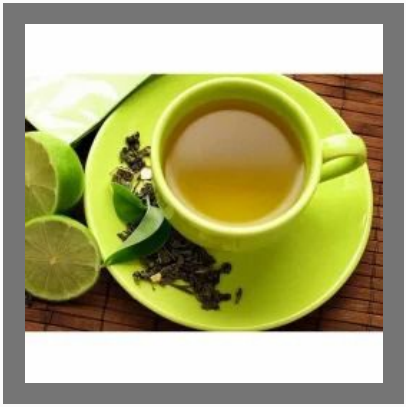
Green Tea Extract Liquid 725