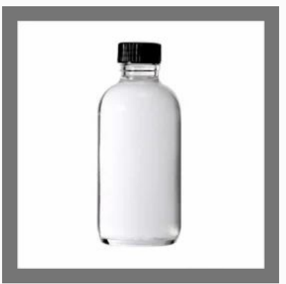
Concentrated Fragrance Oil