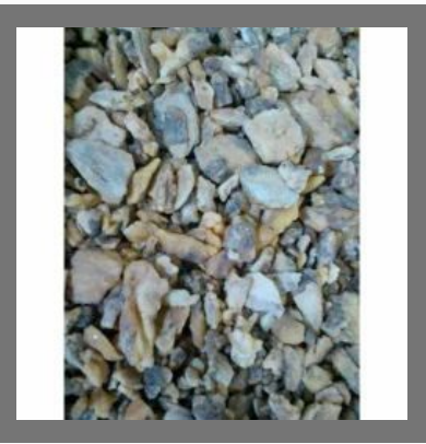
Gum Benzoin Drops (Loban Kodi)