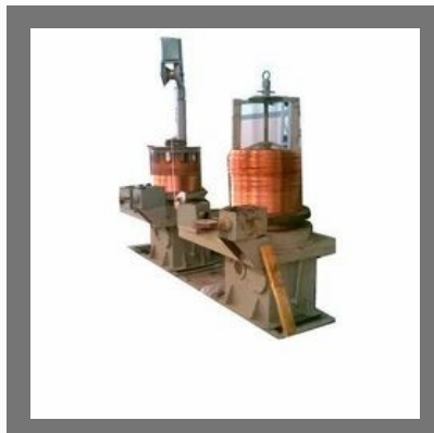
Wire Drawing Machine