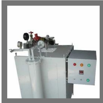
Ammonia Cracker Units