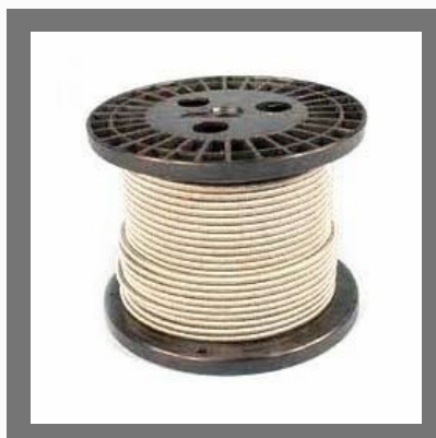
Heating Element Wire