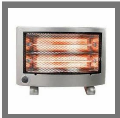
Industrial Electric Heaters