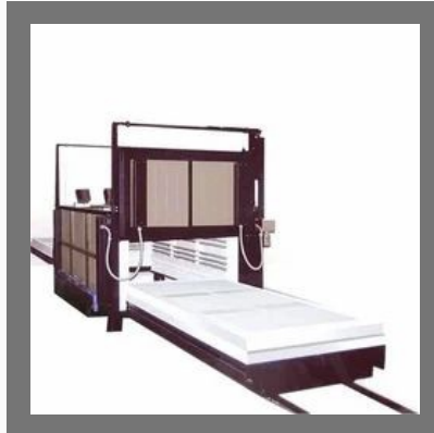
Bogie Hearth Furnaces