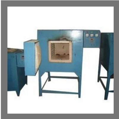
Heat Treatment Furnaces