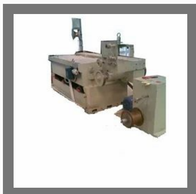
Industrial Wire Drawing Machine