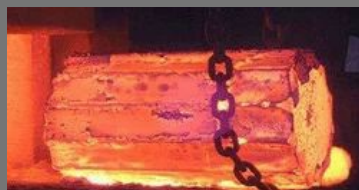
Unforged Pre Heating Ingots