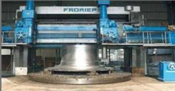
Steel Machinery Castings