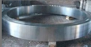
Steel Machinery Casting