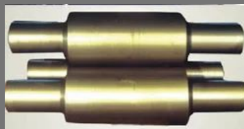
Alloy Steel Base Rolls