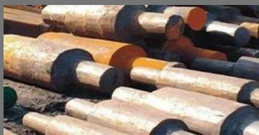
Alloy Steel Forged Rolls