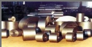
Rolling Flanges & Shafts