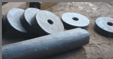
Forged Shaft Chill Rolls