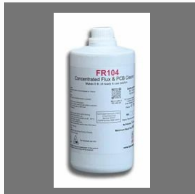
FR104 PCB Cleaner, Concentrated PCB Cleaning Solution For Removal of Flux Residue.