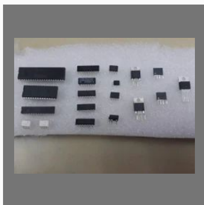
Active Passive Components