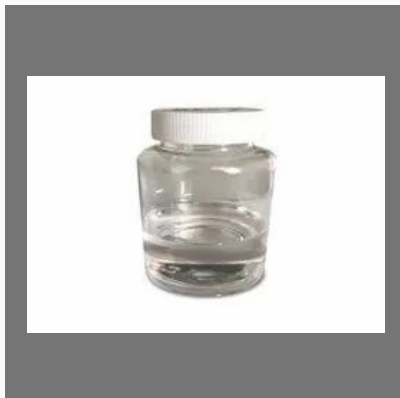
Fatty Alcohols Liquid