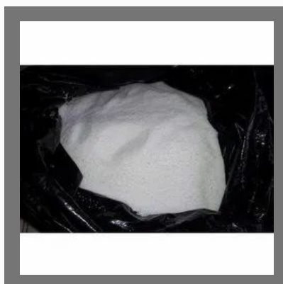
Plastic Stearic Acids