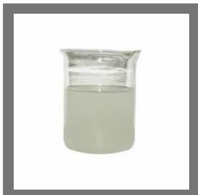
Sodium Lauryl Ether Sulphate Liquid