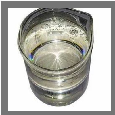
Sodium Lauryl Sulphate Liquid