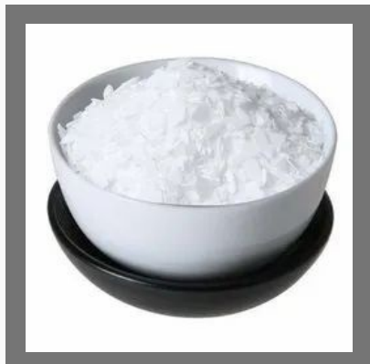
Fatty Alcohols Flakes