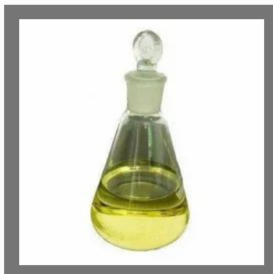
Emulsolic Oleic Acids