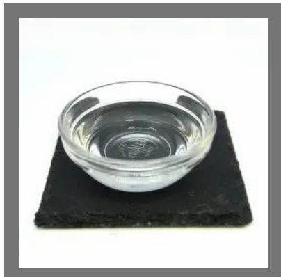
Refined Glycerine BP Liquid