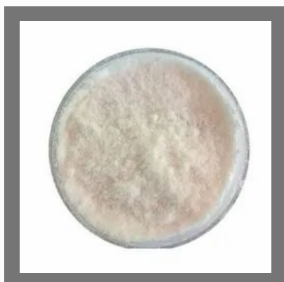
Alpha Olefin Sulfonates Paste