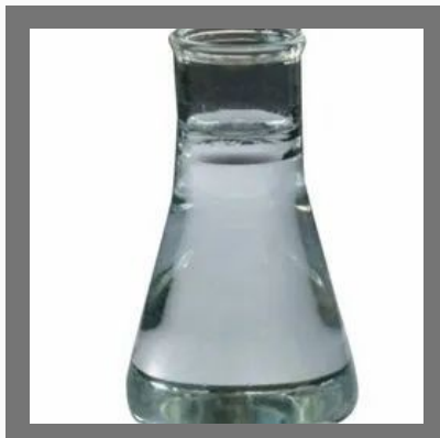
Refined Glycerine IP Liquid