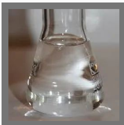
Refined Glycerine IW Liquid