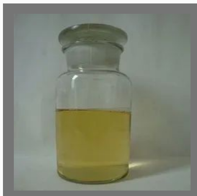
Alpha Olefin Sulfonates