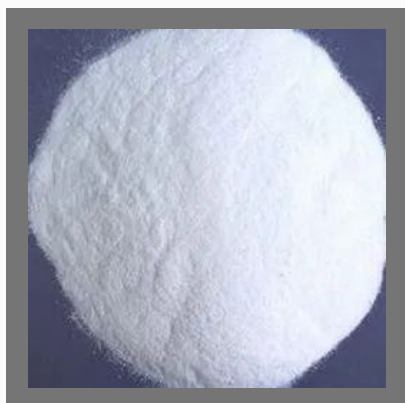
Sodium Lauryl Sulphate Powder