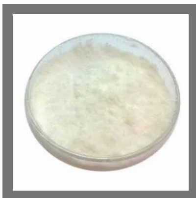
Sodium Lauryl Ether Sulphate Paste