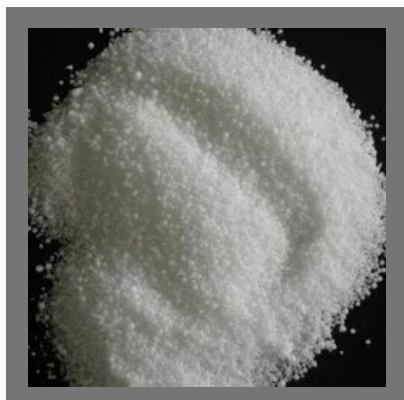
Hystrix Stearic Acid