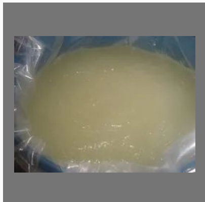
Sodium Lauryl Sulphate Paste