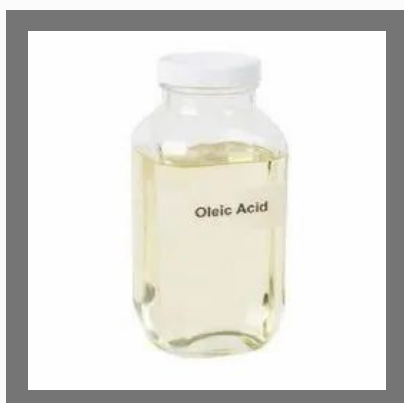
Indolic Oleic Acids