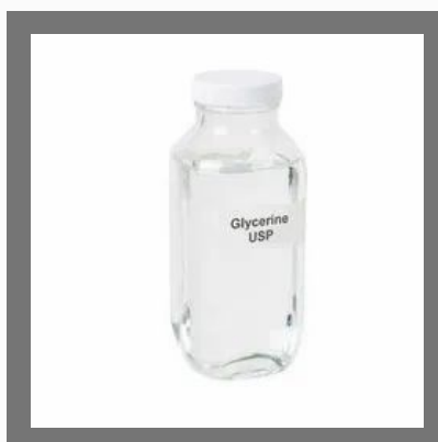
Glycerine Usp Liquid