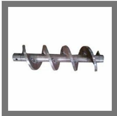
Horizontal Screw Conveyor