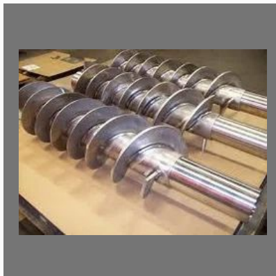
Stainless Steel Screw Conveyor