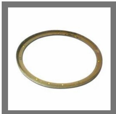
Rolled Angle Ring