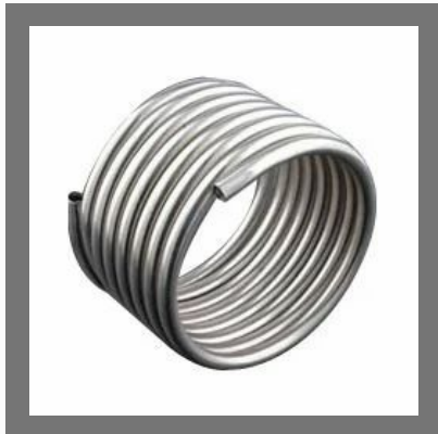
Metal Pipe Bend