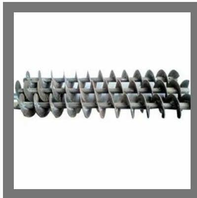
Tubular Horizontal Screw Conveyor