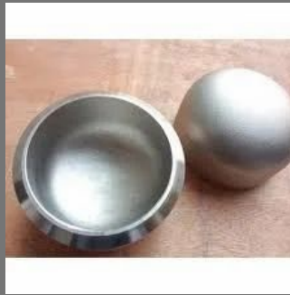
Stainless Steel Caps