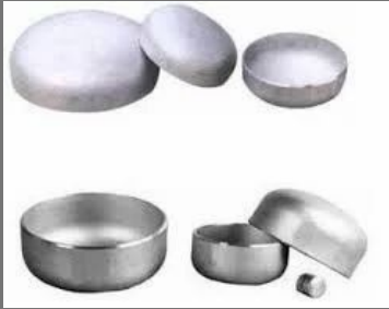
Stainless Steel Pipe Cap