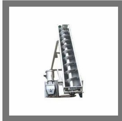
Industrial Vertical Screw Conveyor