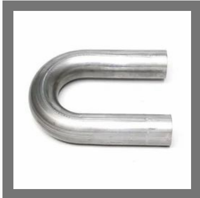
SS U Bend