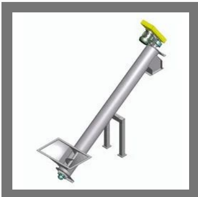
Vertical Screw Conveyor Machine