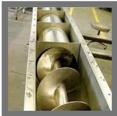
Industrial Horizontal Screw Conveyor