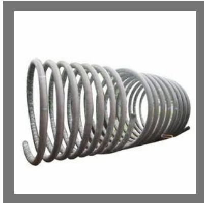
MS Pipe Bend