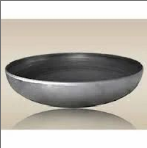
SS Dish End