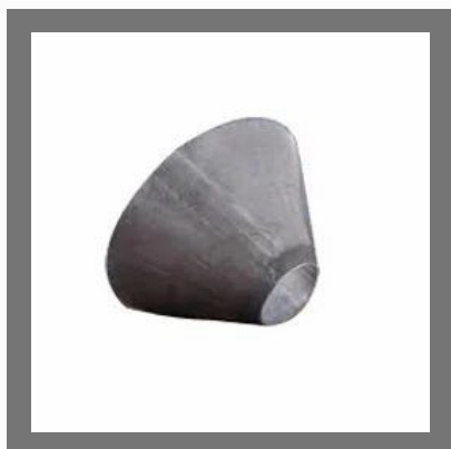
Cone Bending Service