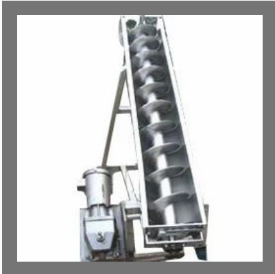
Vertical Screw Conveyor