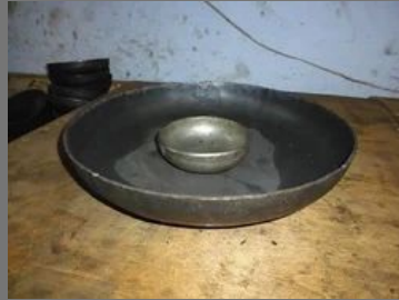
Industrial Dish End