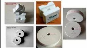
Concrete Cover Blocks