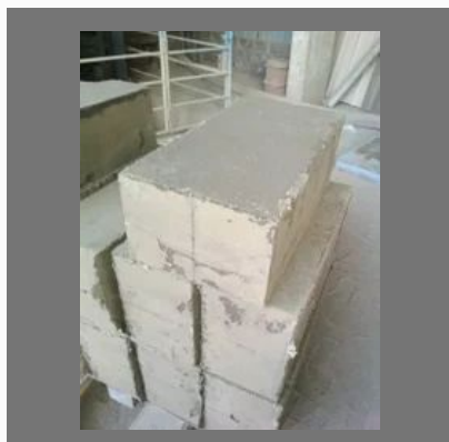
Sunken Filler Light Weight Blocks