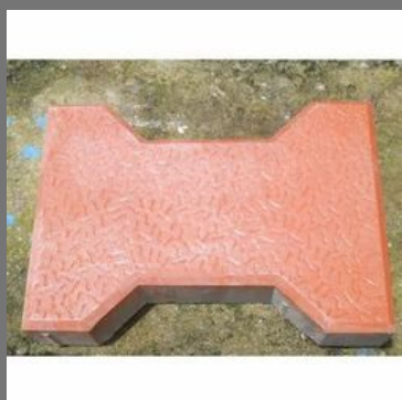
I Shape Vermicular Surface