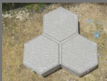
Trihexo Vermicular Surface Paving Blocks