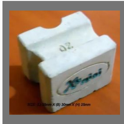
Concrete Cover Block 3 In 1