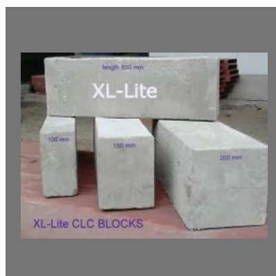
Cellular Lightweight Blocks