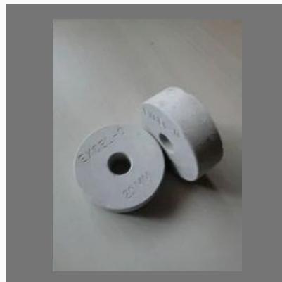
Concrete Cover Block Round 25