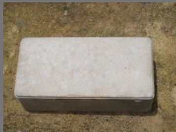
Sand Blast Rough Finish Paving Stone