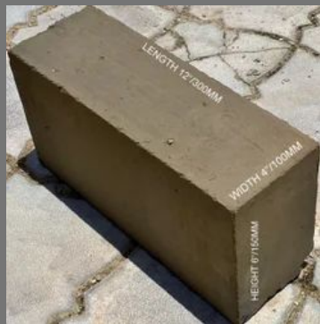
Cellular Light Weight Concrete Bricks