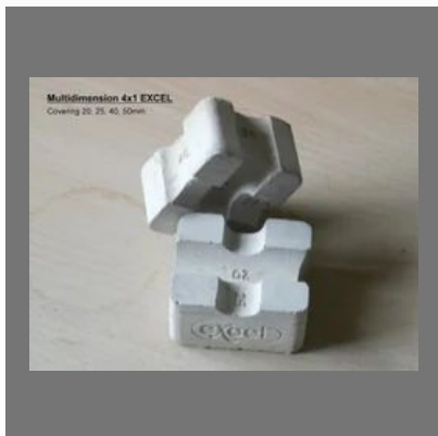
Concrete Cover Blocks