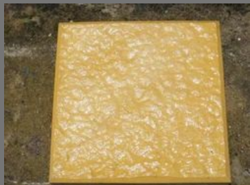
Rough Granite Stone Finish