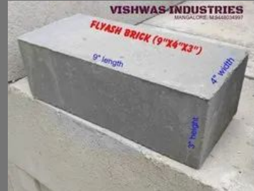
Light weight Brick