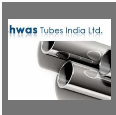
Steel Pipes & Tubes