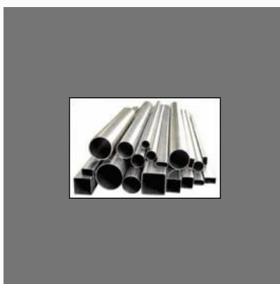
Hot Dipped Galvanised Tubes