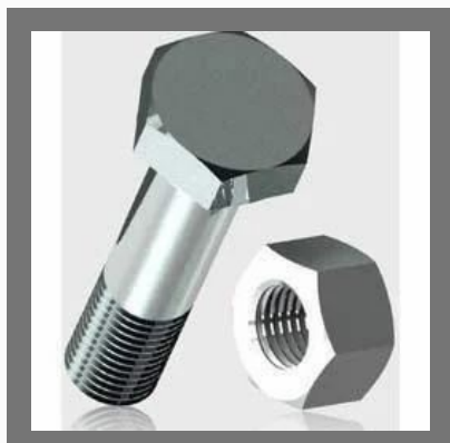
Steel Nuts Bolts