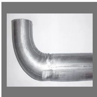
Aluminised Steel Tubes