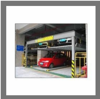
Automatic Parking Management System