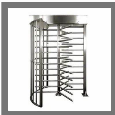
Full Height Turnstile