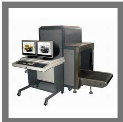
X-Ray Baggage Scanner