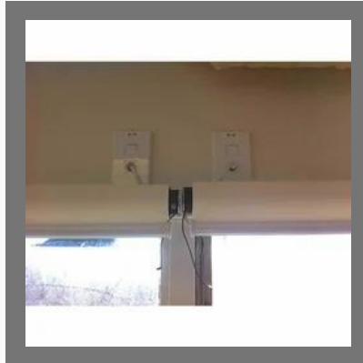
Motorized Roller Blind