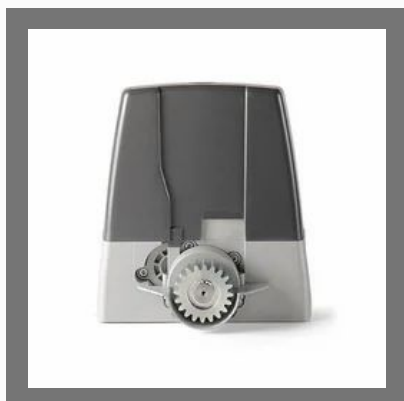
Sliding Gate Motor