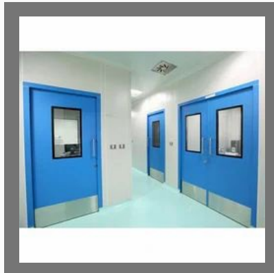
Clean Room Door