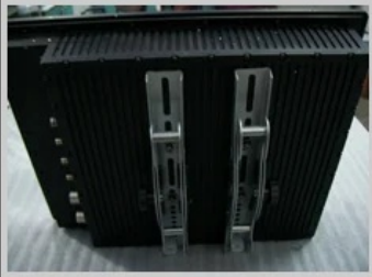
Sheet Metal Components