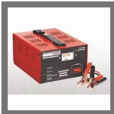
Battery Chargers for material handling Equipments