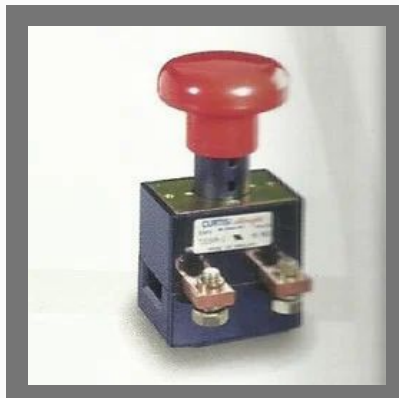
Emergency Disconnect Switches