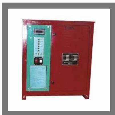
Traction Battery Chargers