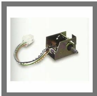
Electronic Throttle Assemblies