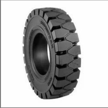
Material Handling Tyres