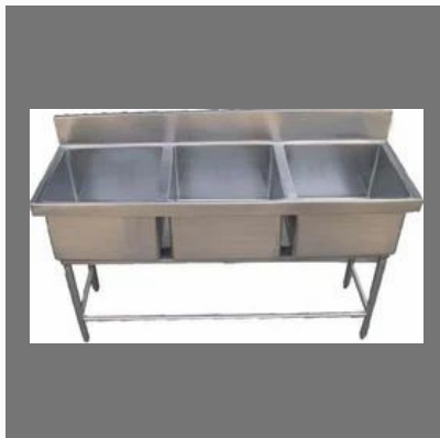
Three Sink Unit