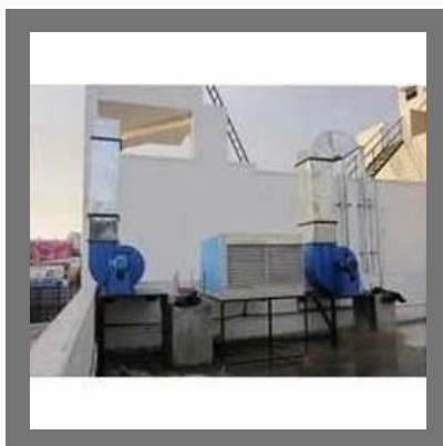
Fresh Air Ventilation Unit