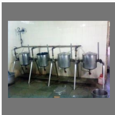
Steam Cooking Equipment