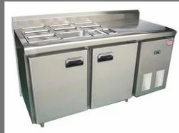
Stainless Steel Bain Marie