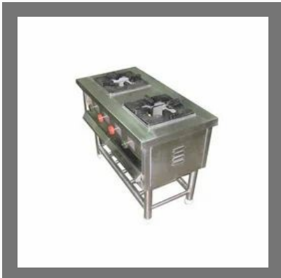
Two Burner Cooking Range