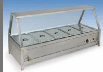
Hot Bain Marie