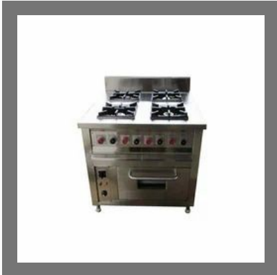
Four Burner Range