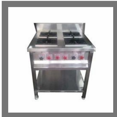
Four Burner Continental Gas