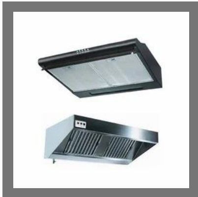
Kitchen Exhaust Hood