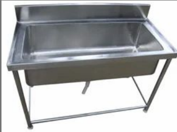
Pot Wash Sink