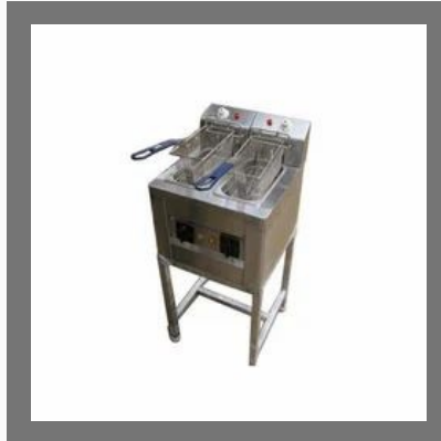
Deep Fat Fryer