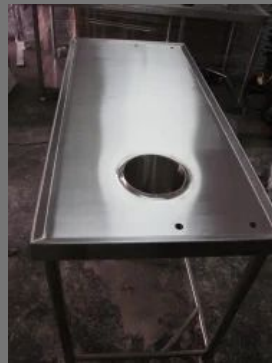
Soiled Dish Table