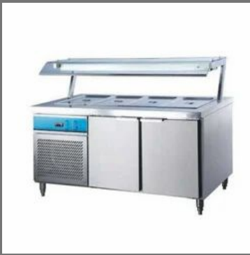
Cold Bain Marie