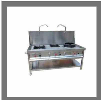
Three Burner Cheese