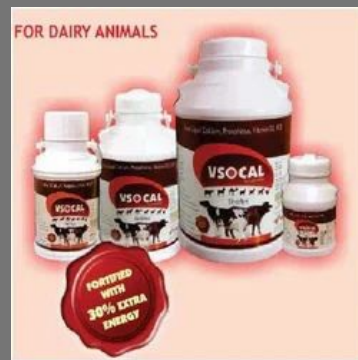
Oral Nutritional Supplement