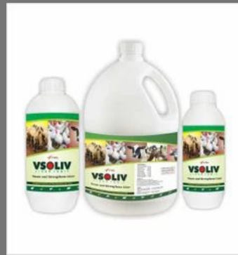
Dairy Feed Supplements