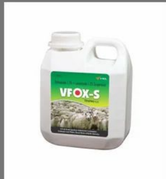
Dairy Digestive Supplement