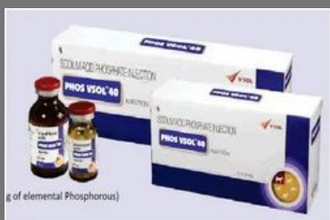
Sodium Acid Phosphate injection