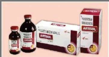
Animal Anti Inflammatory Injection