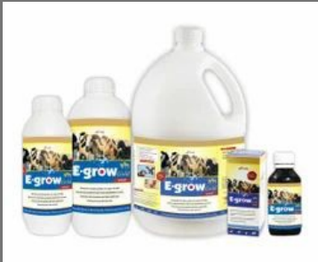
Cattle Feed Supplement Syrup