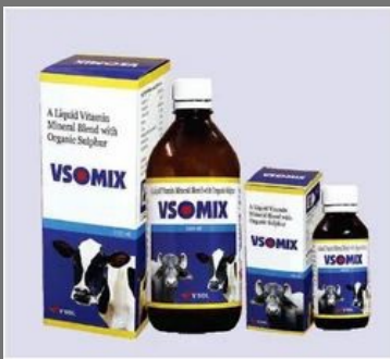
Animal Nutrition Supplements