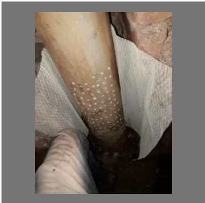
Revival Of Old Borewells By Different Methods