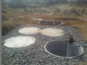
Construction Of Rain Water Filter Chamber