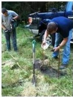
Survey Water Finding