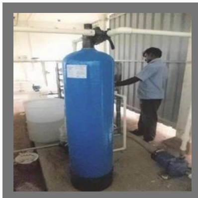
Water Treatment Plants Annual Maintenance Service