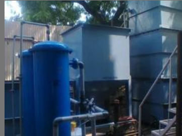
Packaged Sewage Treatment Plant