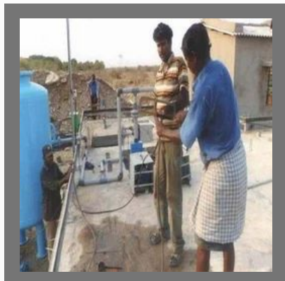
Erection Commissioning Service