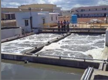
Effluent Treatment Plant