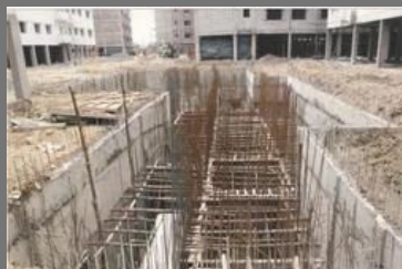
Ongoing project (4)