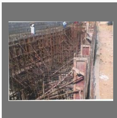
Ongoing project (3)