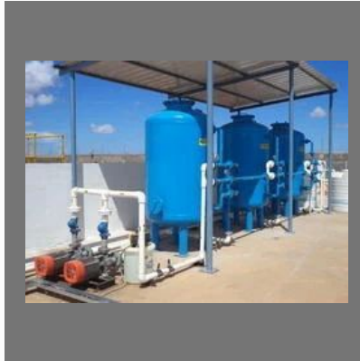
Water Softener Plant