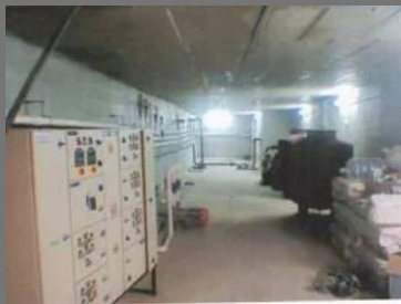
Underground Sewage Treatment Plants