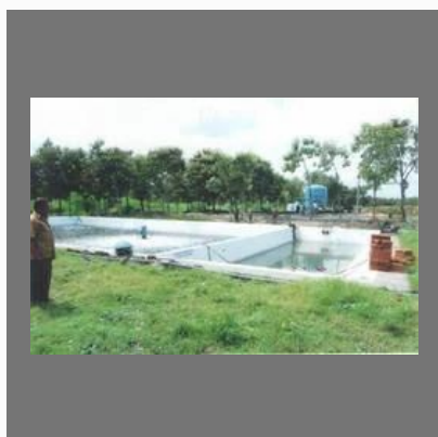
Upgradation Of Existing Projects