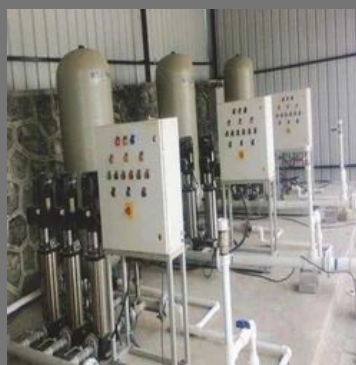
Hydro Pneumatic System