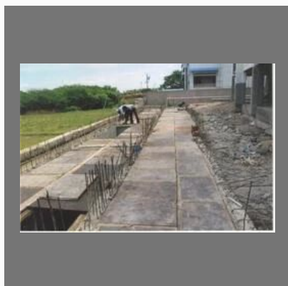
Ongoing project (2)