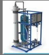
Ultra Filtration Plants