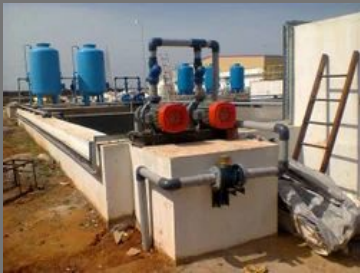
Waste Water Treatment Plant