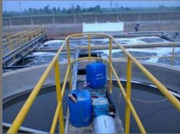
Sewage Treatment Plant