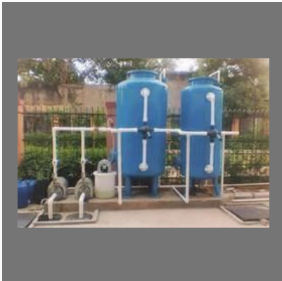
Water Filtration Plant