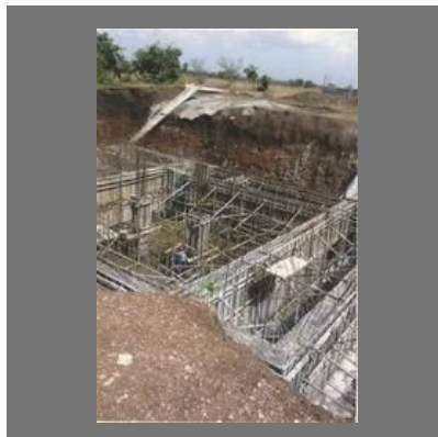
Ongoing Project (1)