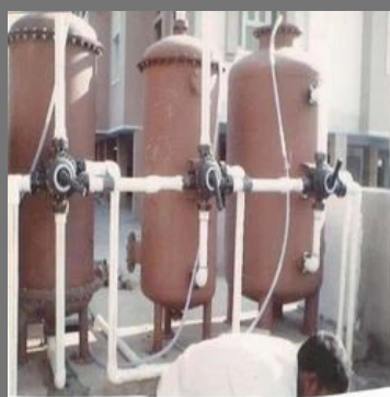
Fluoride Removal Plant