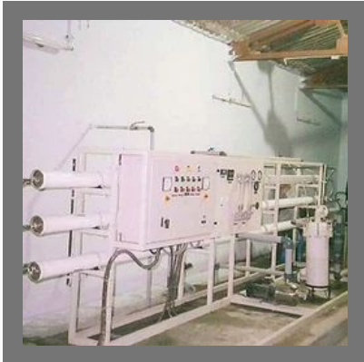
Mineral Water RO Plant