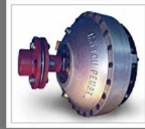
Fluid Coupling (FCU/SDFC)