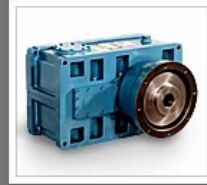
Single Screw Extruder