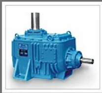
Bevel Helical Cooling Tower Gearbox