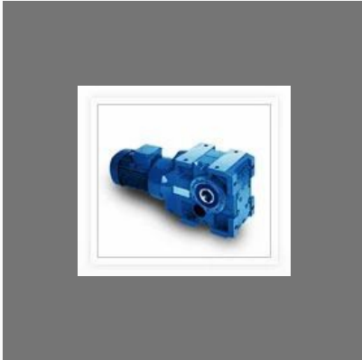
Co-axial Helical Geared Motors (BM Series)