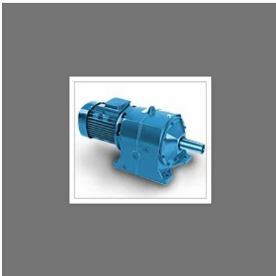
Co-axial Helical Geared Motors