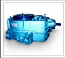
Coal Pulverizing Mill Gearbox