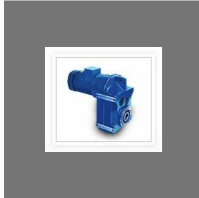
Co-axial Helical Geared Motors (sm Series)