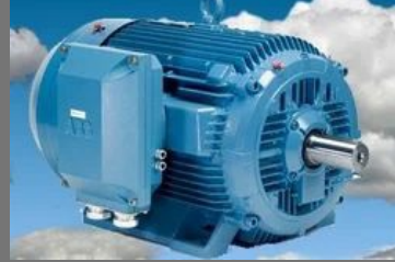
ABB Nema Motors