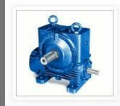
Modular Worm Gear Box