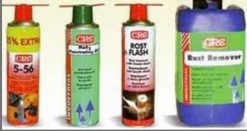
Penetrate and Rust Loosener