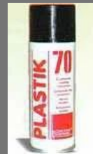
Plastik 70 Conformal Coating