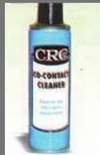
CO Contact Cleaner