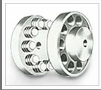
Cone Ring Flexible Coupling