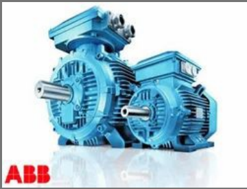
Low Voltage Motors