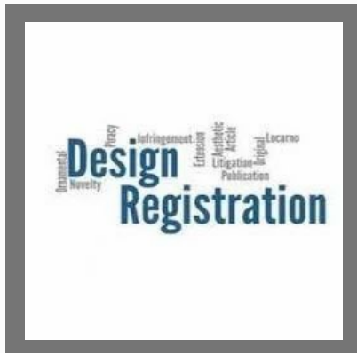
Design Patent Registration Services