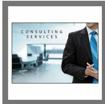
Design Patent Consultancy Services