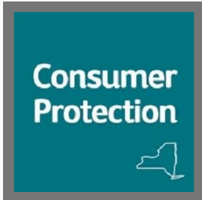
Consumer Protection And Mediation