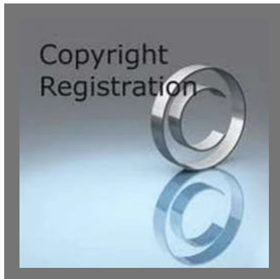
Copyright Registration Services