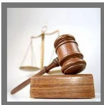
Trademark Litigation Services