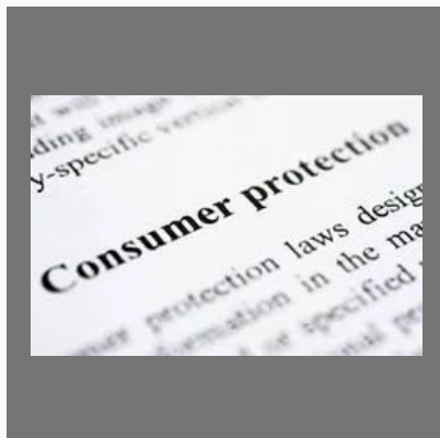
Consumer Protection Services