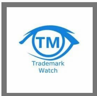
Trademark Search Services