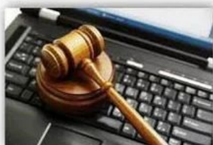
Cyber Law Consultancy Services