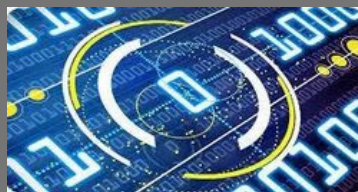
Information Technology Law