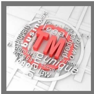
International Trademark Registration Services