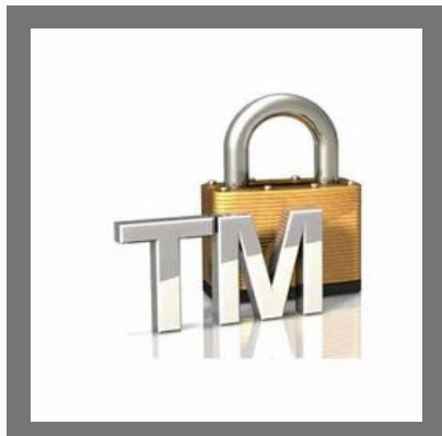
Trademark Filing and Registration Services