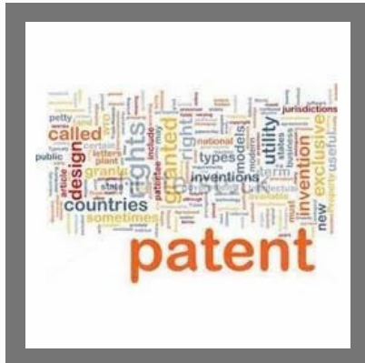
Design Patent Filing Services