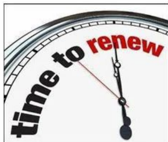
Trademark Renewal Services