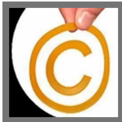
Copyright Consultancy Services