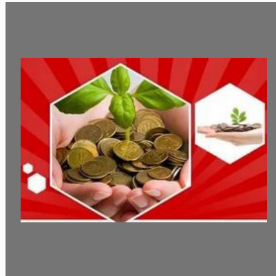
Recurring Deposit Plus