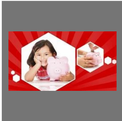
Future Plan Financial Service