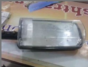
LED Street Light Dome