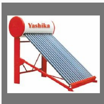
Solar Water Heater