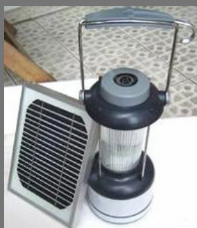
Solar Camping Lantern