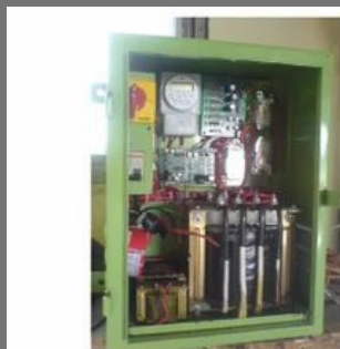
3KVA Single Phase Energy Saver