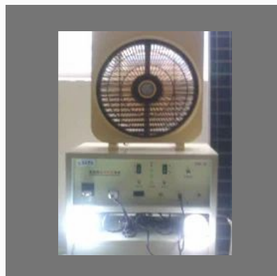
Solar Home Lights