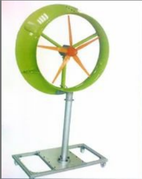
High Efficient Wind Mill