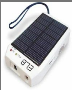
Solar Mobile Charger / Radio