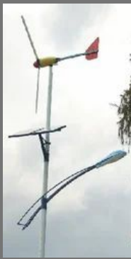
200 Watt High Efficient Domestic Wind Mill