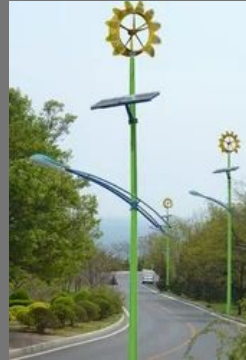
200 Watt High Efficient Domestic Wind Mill