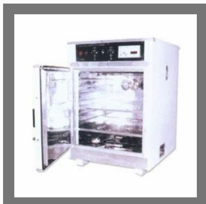
Hot Air Oven