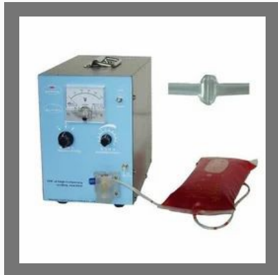
Blood Bag Tube Sealer