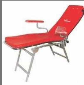
Blood Donor Lounge DC-60x