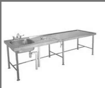
Post Mortem Table