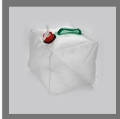
Collapsible Jerry Can