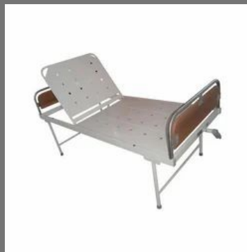
Semi Fowler Bed