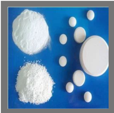
Water Purification Tablets