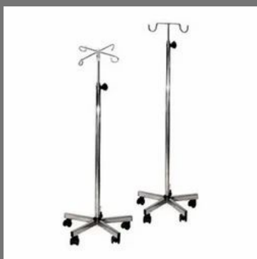
Hospital Pole Saline Stand