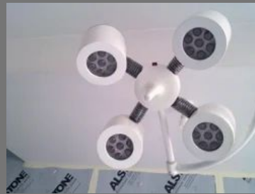
Operation Theatre Light (OT Light)