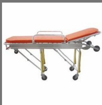
Ambulance Stretcher Trolley