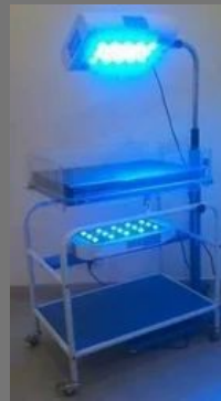
Double Surface Phototherapy Unit