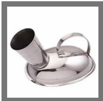
Female Urine Pot