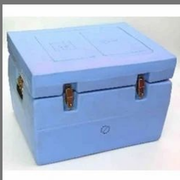
Vaccine Cold Box YCB 444