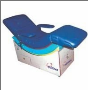
Blood Donor Lounge - DC-80x