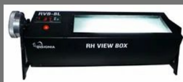
RH View Box