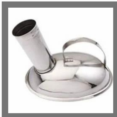
Male Urine Pot