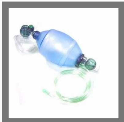
Resuscitator (Ambu Bag)