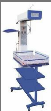
Infant Radiant Warmer (Tiana NW)