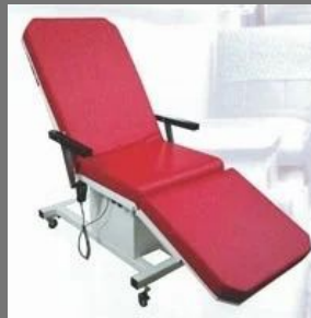
Blood Donor Lounge - DC-100x