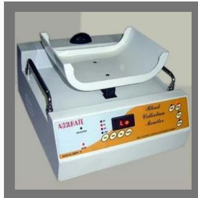
Blood Collection Monitor