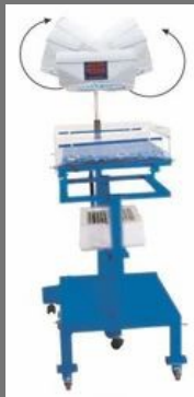
Single Surface Phototherapy Unit