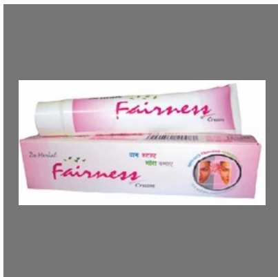
Zee Herbal Fairness Cream