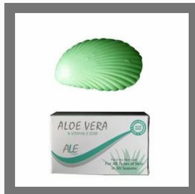
Aloe Vera Soap