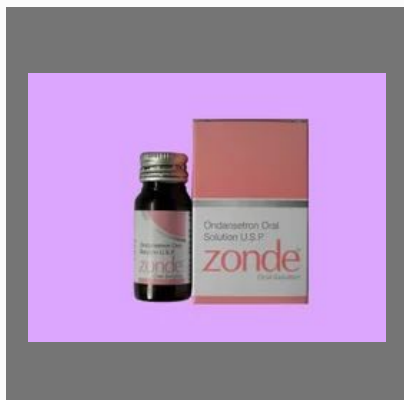
Zonde Oral Solution