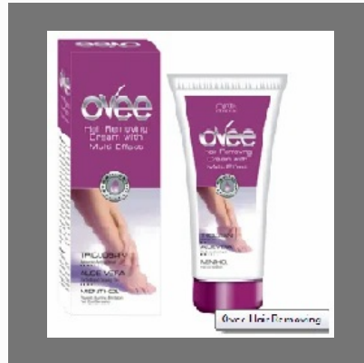
Ovee Hair Removing