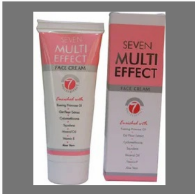
Seven Multi Effect