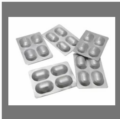
Ivermectin 6mg Tablets