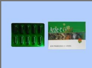
Arze Gold Capsules