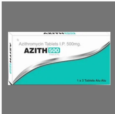
Azith-500 Azithromycin 500mg Tablets