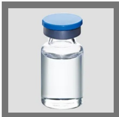
Doxycycline 100mg Injection