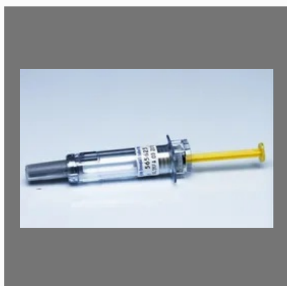
Enixerin Enoxaparin 60 mg/0.6 ml Injection