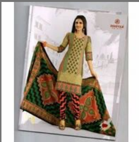
Ladies Chudidhar Suits