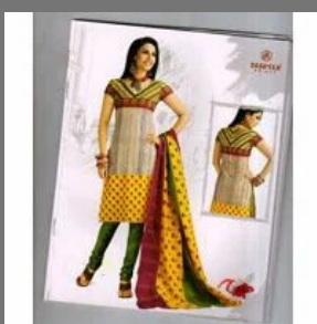
Ladies Chudidar Suits