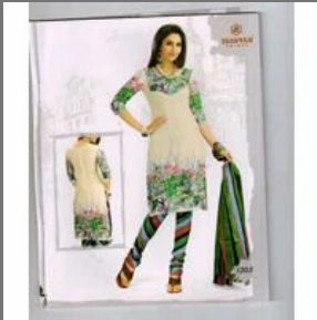
Ladies Chudidhar Suits