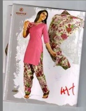
Ladies Salwar Suit