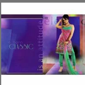
Ladies Churidar Suits