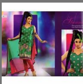
Ladies Churidar Suits