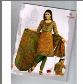
Ladies Churidar Suits