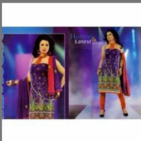
Ladies Churidar Suits