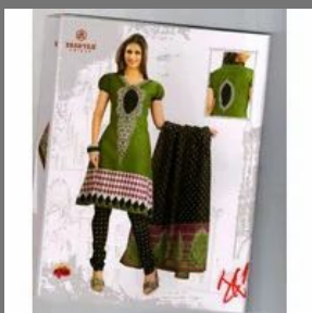
Ladies Churidar Suits