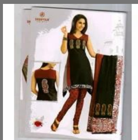
Ladies Chudidar Suits