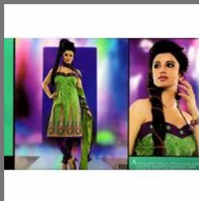
Ladies Churidar Suits