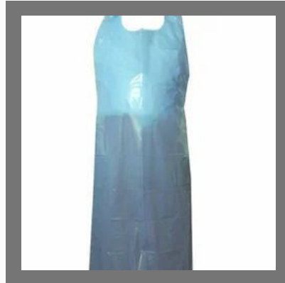
Biopron Poly Apron