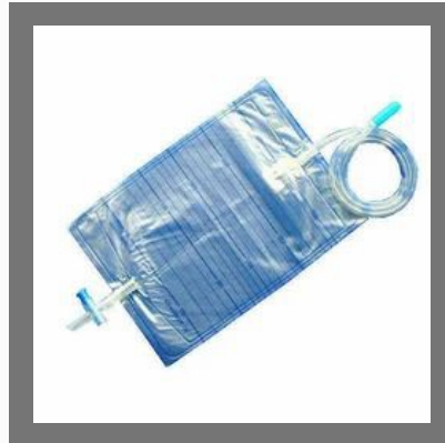
Plastic Urine Collection Bag