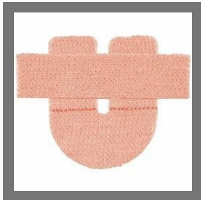
Medical Elastic Adhesive Bandage