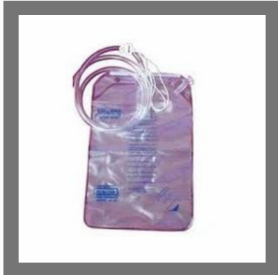
Hospital Urine Collection Bag