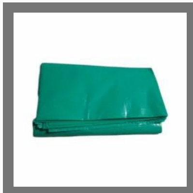
Plain Poly Surgical Drape