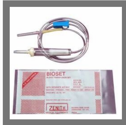
Blood Transfusion Set