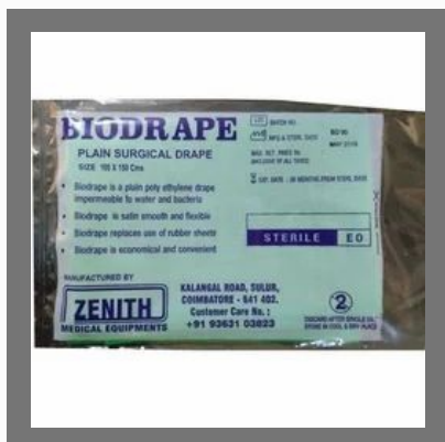
Biodrape Plain Surgical Drape