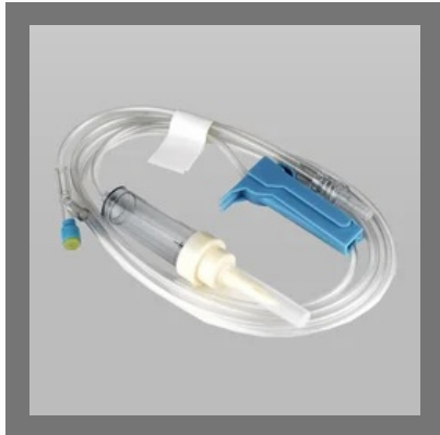
Disposable Sterile Infusion Set