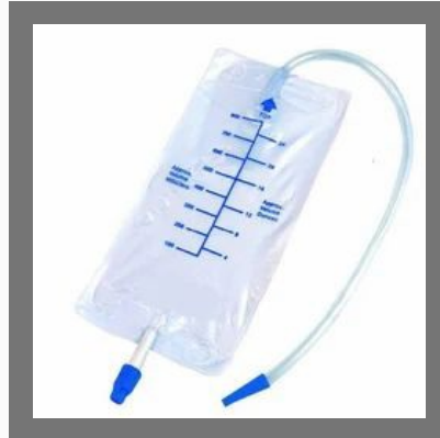
Disposable Urine Collection Bag