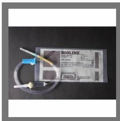
Disposable Micro Drip Set