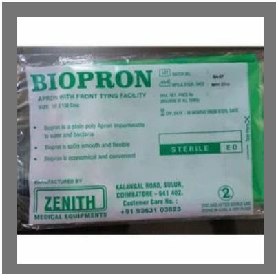
Biopron Disposable Apron