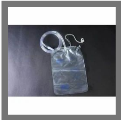
PVC Urine Collection Bag