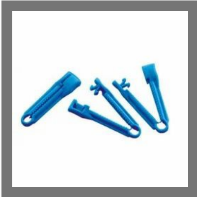
Disposable Umbilical Cord Clamp