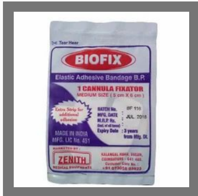
Zenith Biofix Elastic Adhesive Bandage