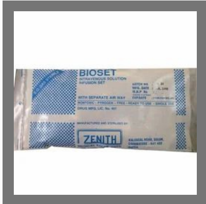
Intravenous Solution Infusion Set