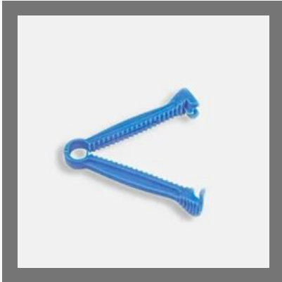
Umbilical Baby Cord Clamp