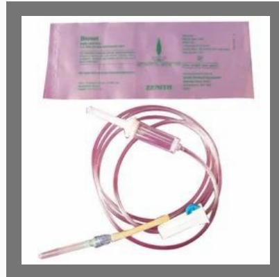
Bioset I.V. Infusion Set