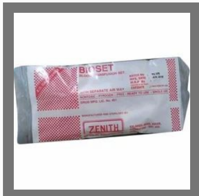
Bioset Blood Transfusion Set