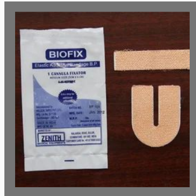
Biofix Elastic Adhesive Bandage B.P