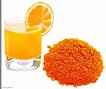
Energy Booster Powder