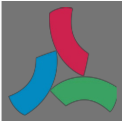
PCD Pharma Franchisee