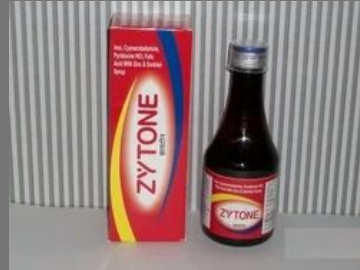
Carbonyl Iron, Folic Acid, Cyanocobalamin