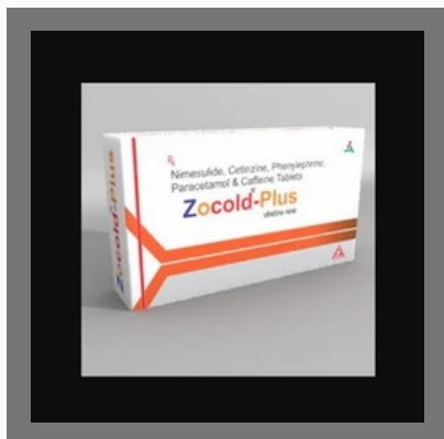
Paracetamol Phenylephrine CPM