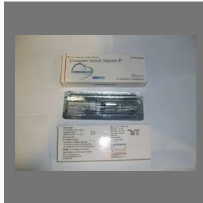
Enoxaparin Sodium 60 Mg/0.6ml