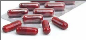
Multivitamins, Antioxidant with Beta-Carotene