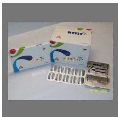
Taurine 500mg Racemethionine 200mg Capsules (RTFiT TAB)