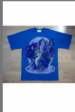
Tee Shirts Digital Printing Service