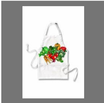
Aprons Garment digital Printing