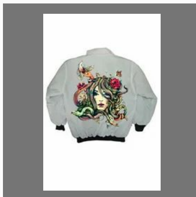
Digital Printing On Jackets