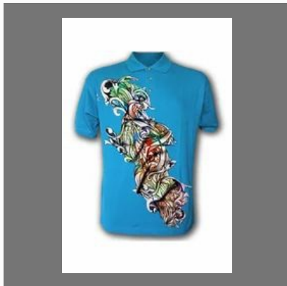
T-Shirts Digital Printing Service