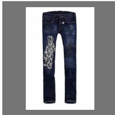
Jeans Digital Printing