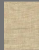
Linen Digital Printing Service