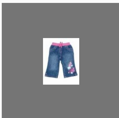
Digital Printing Service on Denim Material