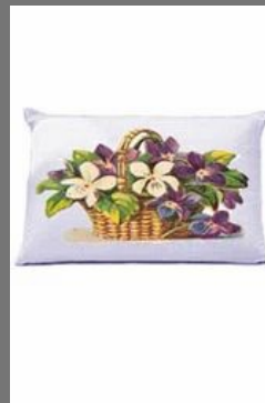
Pillow Covers Digital Printing Service