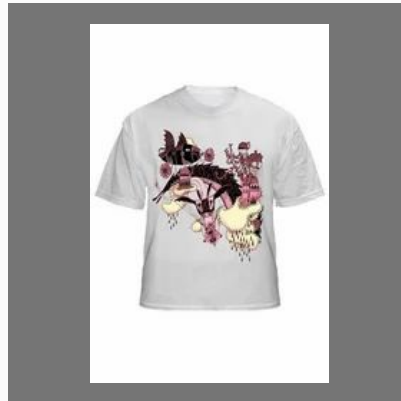
Tshirts Digital Printing Service