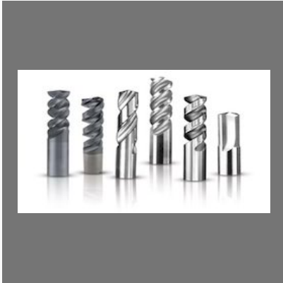
Solid Carbide Drills