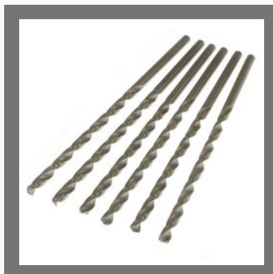
HSS Std Long Drills