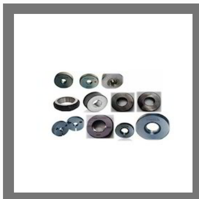
Thread Ring Gauges