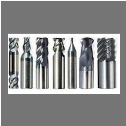
Solid Carbide End Mills