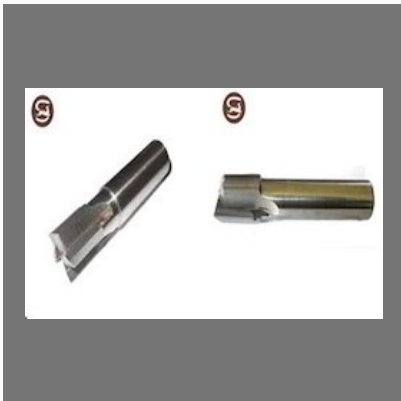
Carbide Tipped End Mill / Slot Drill