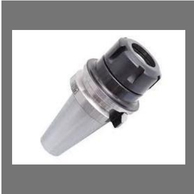
ER Collet Adaptors