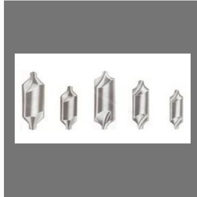
Solid Carbide Center Drills Bits