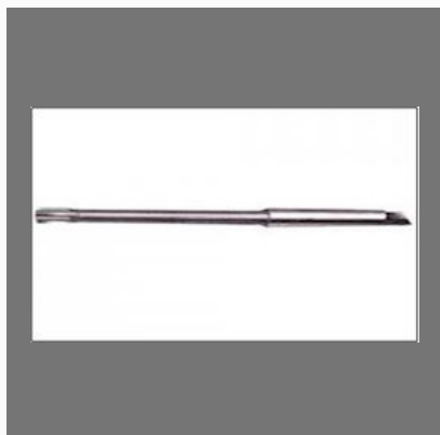
Carbide Tipped Reamers