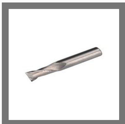
Std/Ex. Long Slot Drills