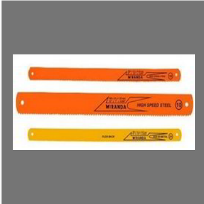
HSS Hacksaw Blade