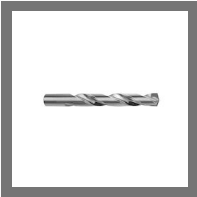
Carbide Tipped Drills