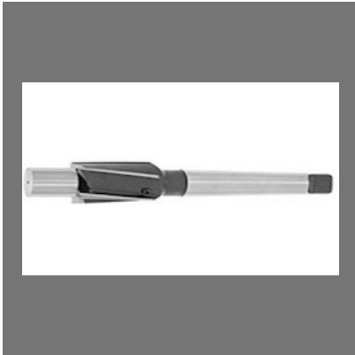
HSS Counter Bore Cutter