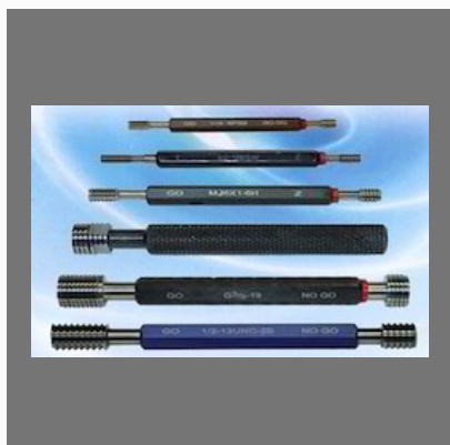
Thread Plug Gauges