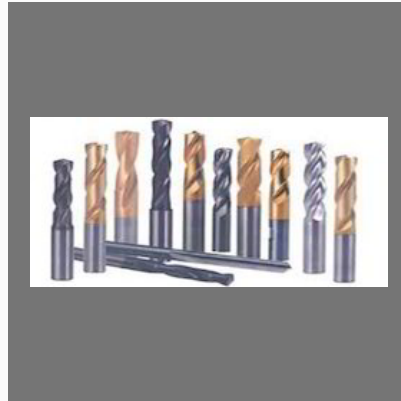
Solid Carbide High Performance Drills