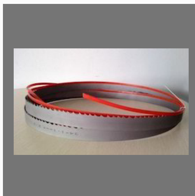
Bimetetal Bandsaw Blade