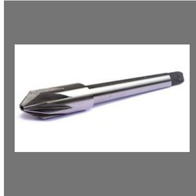
HSS PSH/TSH Counter Sink Cutter