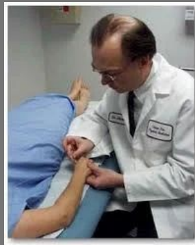
Physical Pain Management