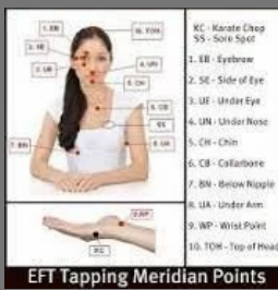
Emotional Freedom Technique