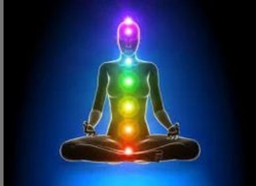
Chakra Reading, Diagnosis & Healing