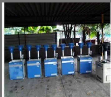
Ambient Air Sampler