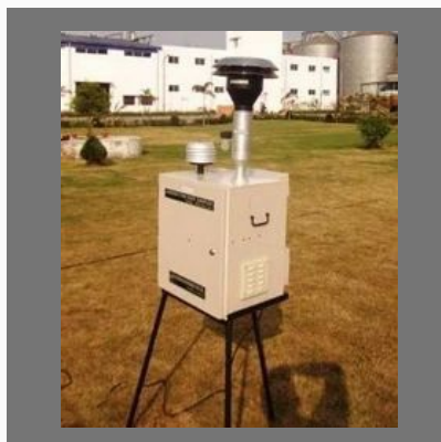
Ambient Air Quality Monitoring Equipment