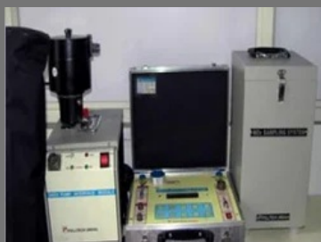
Stack Monitoring Kit