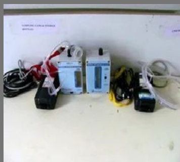
Personal Gas Sampler