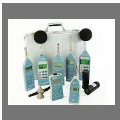
Noise Monitoring Services