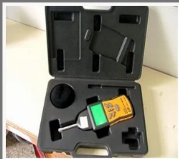
Sound Level Meter