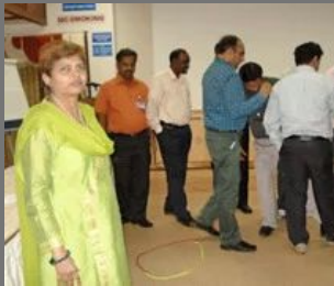
Individual Capability Building Programmes