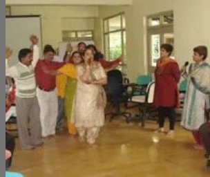
Building Cohesive Teams