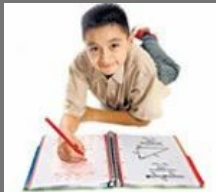
Child Guidance Clinic